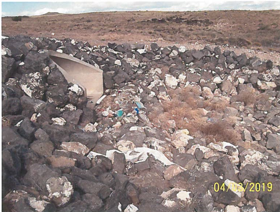
Different view of waste(s) at drainage outfall