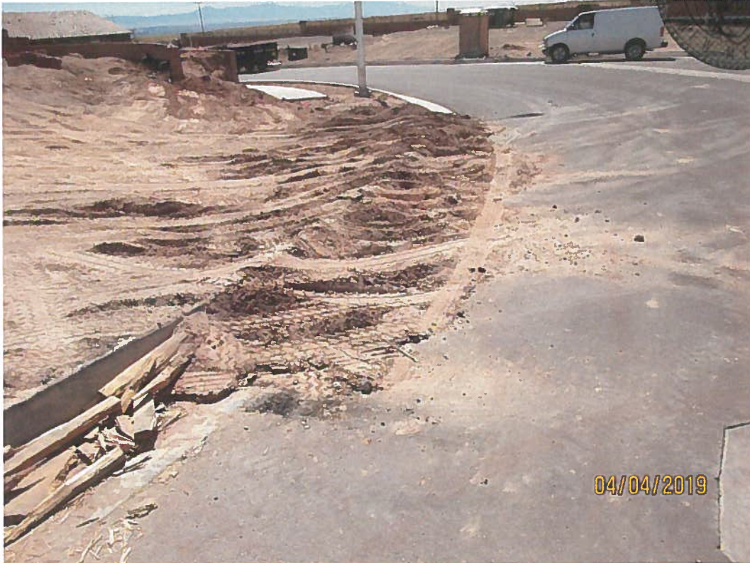
Another dirt ramp constructed in street.