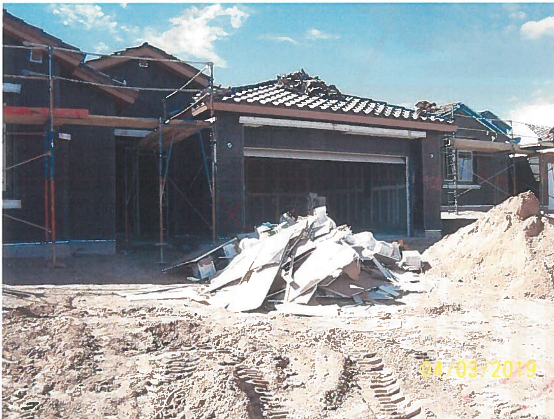
Construction waste pile at 9115 or 9119 Vista Bosquejo NW.