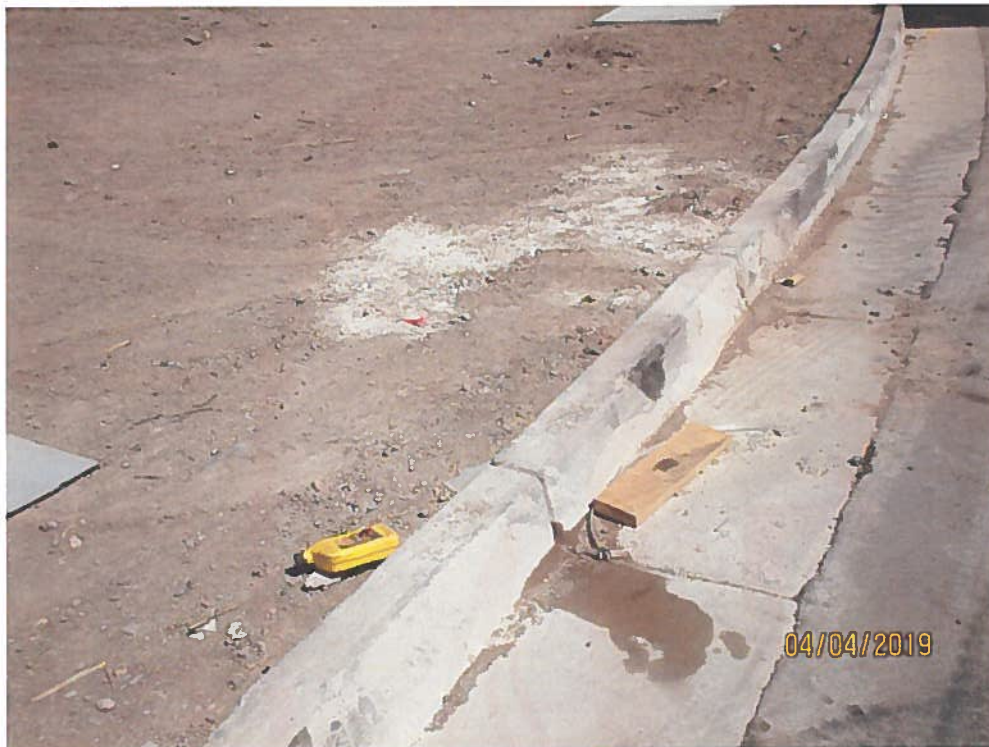
One of numerous wash-outs from cutting the curb. Oil in gutter with oil can.