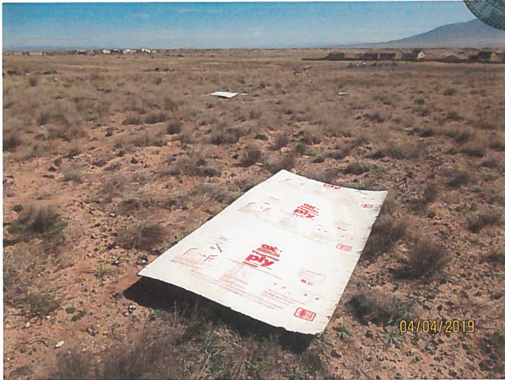
Construction site waste north of project.