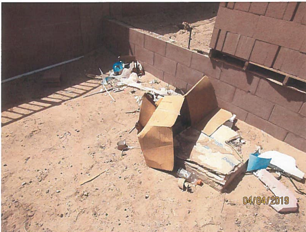
Waste in backyard a couple lots west of above picture.