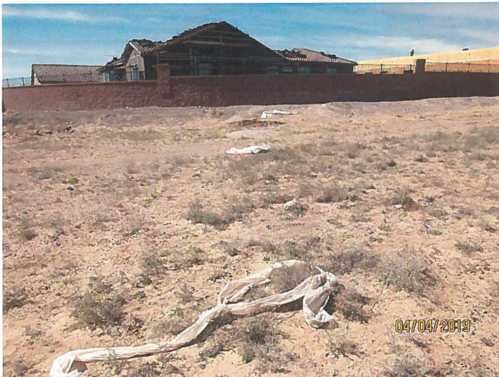
This construction site waste is the plastic wrapping from the roof tiles.