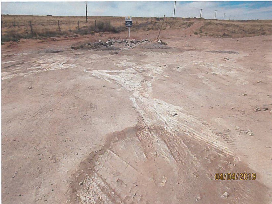
Approximately 500 sq. ft of wash-out on the ground adjacent to the pit.