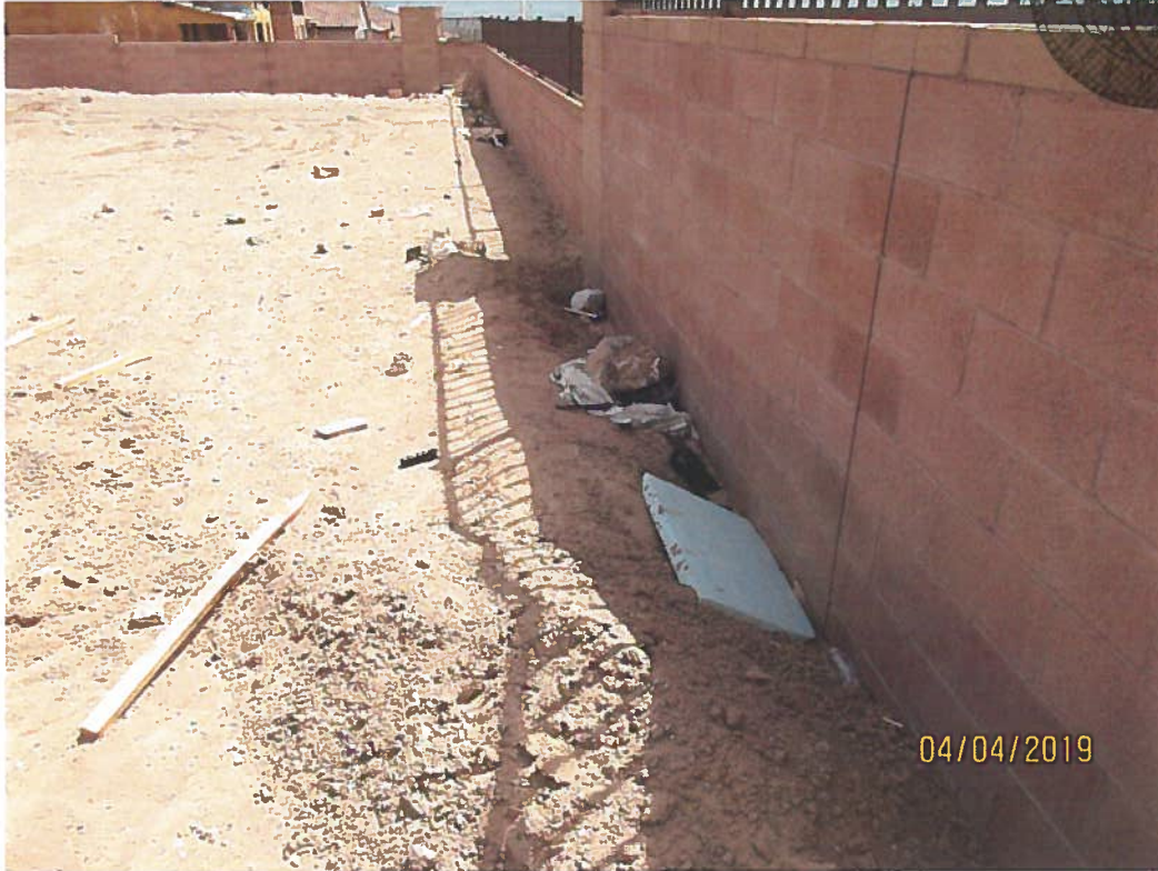
Construction waste on lot near subdivision entrance. South lot line.