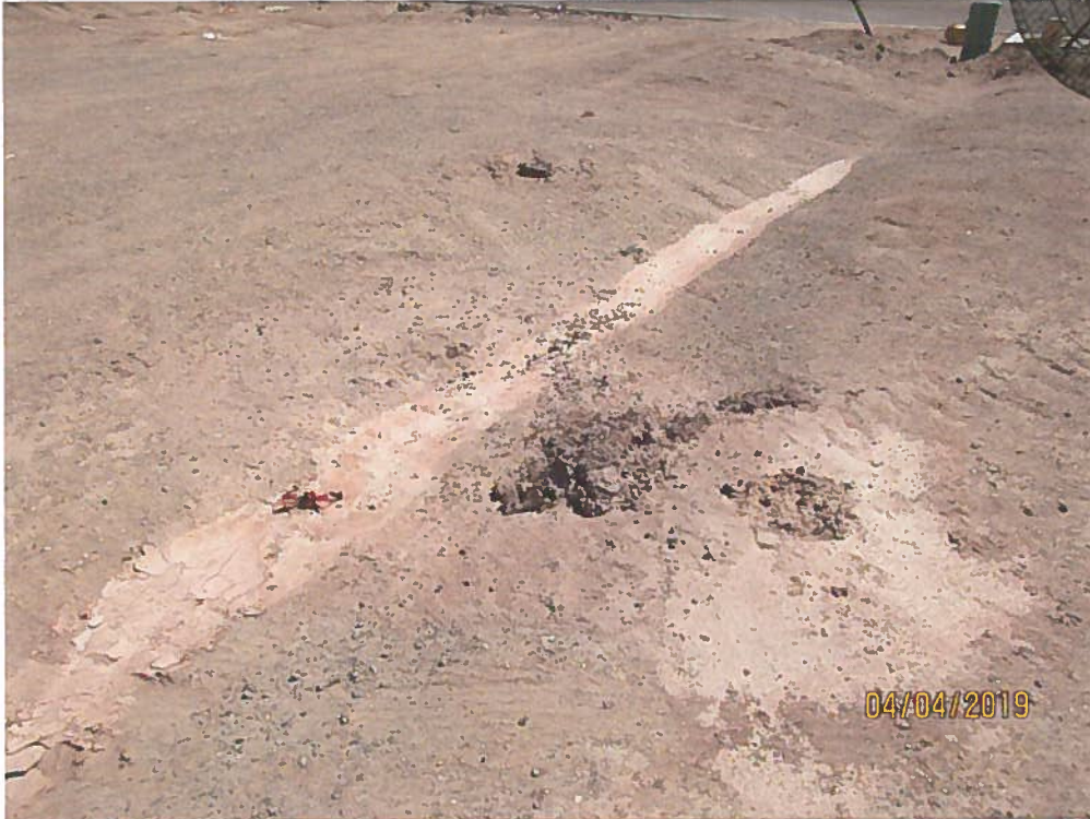
Mortar wash-out on the ground at 6727 Piedra Aspero.