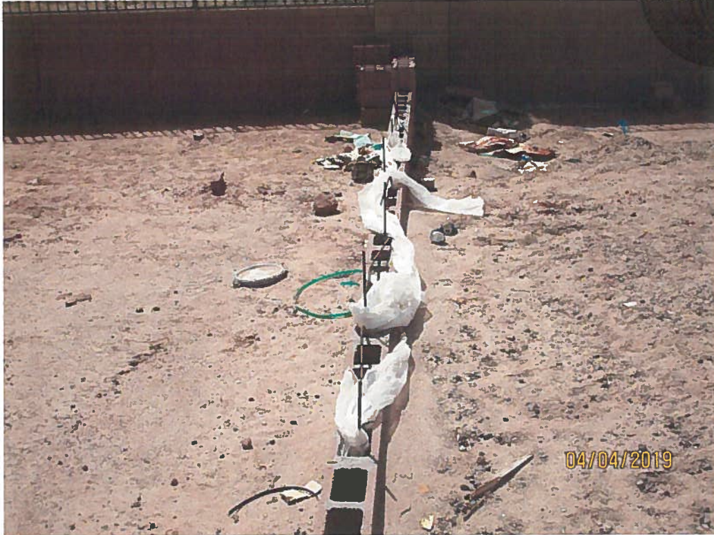
Roof tile wrapping and other waste not in an acceptable waste container.