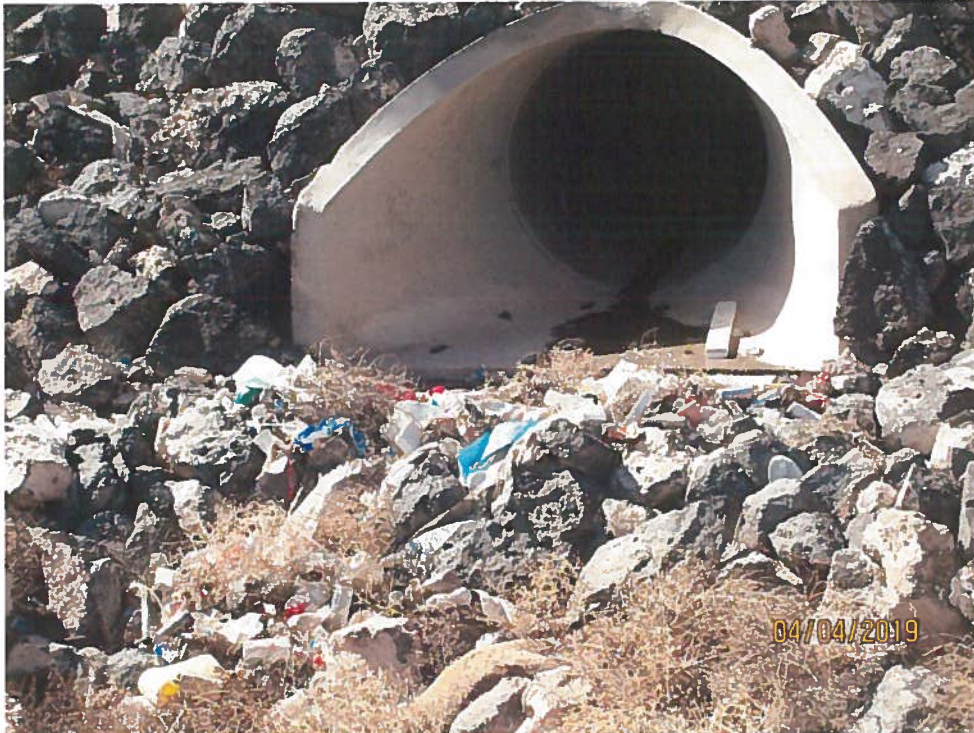
Waste(s) at subdivision drainage outfall.