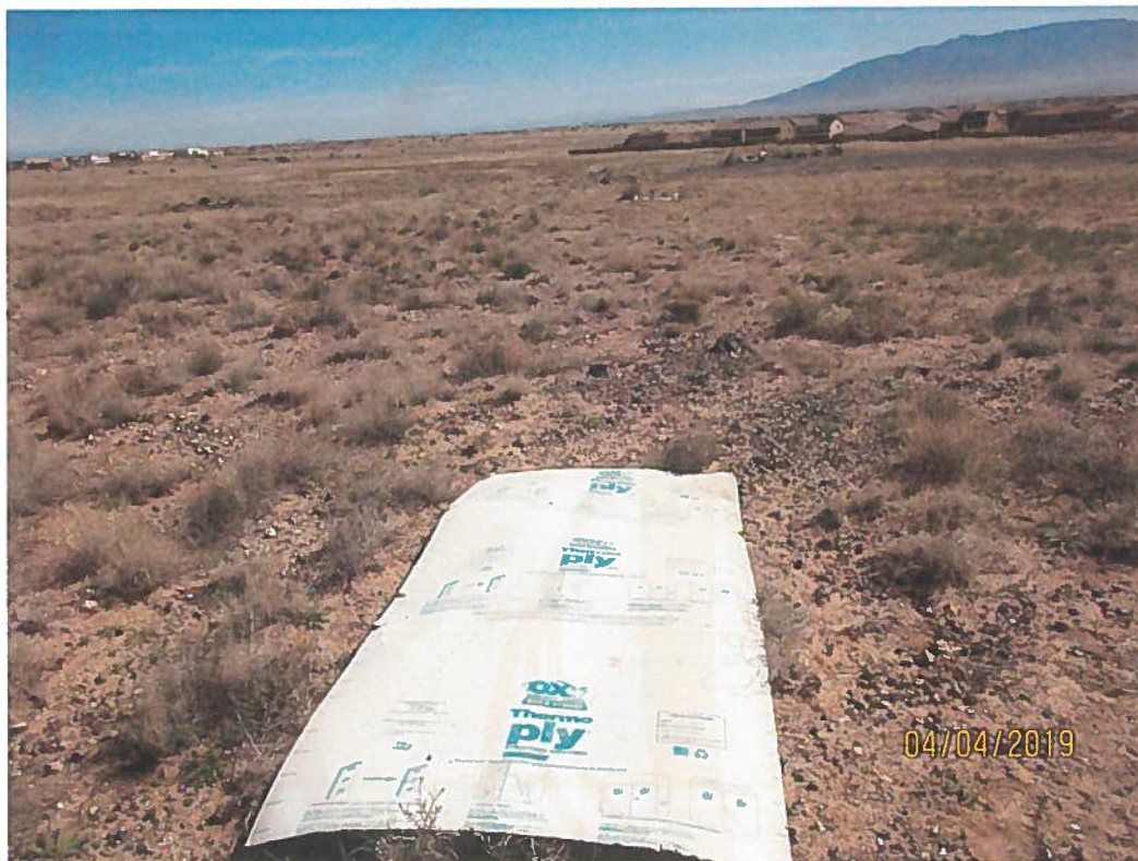
Construction waste offsite north of project.