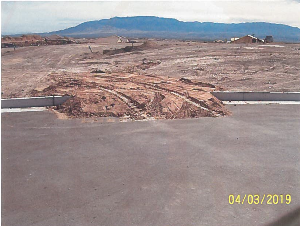
Another dirt ramp constructed in street.