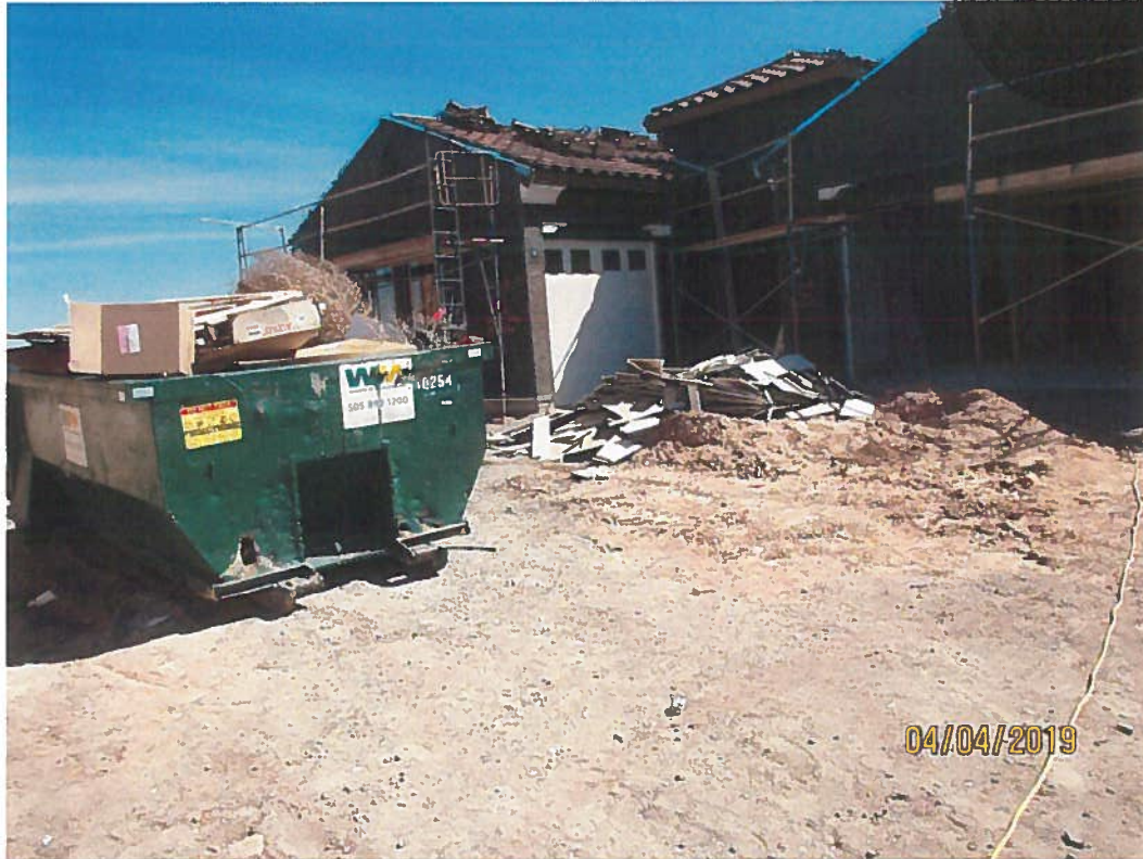
Sheetrock pile at 9001 Retablo NW