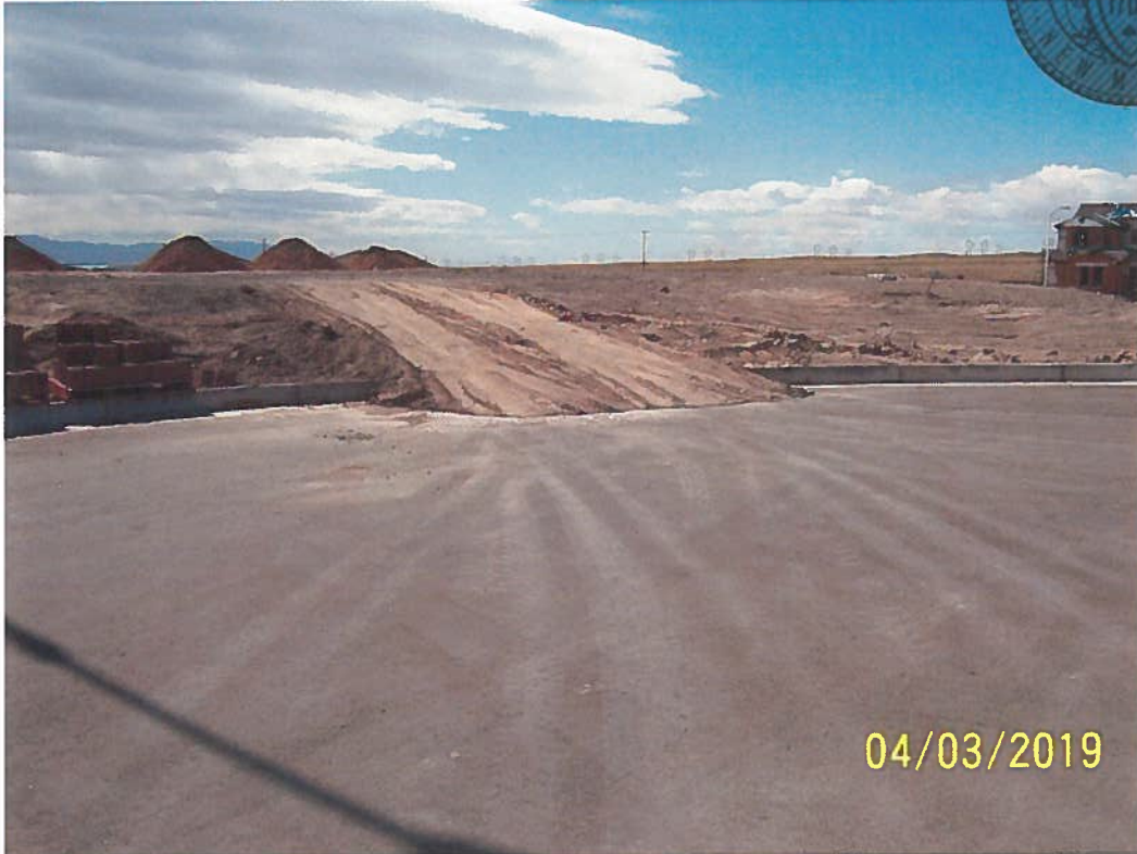
Dirt ramp constructed in street.