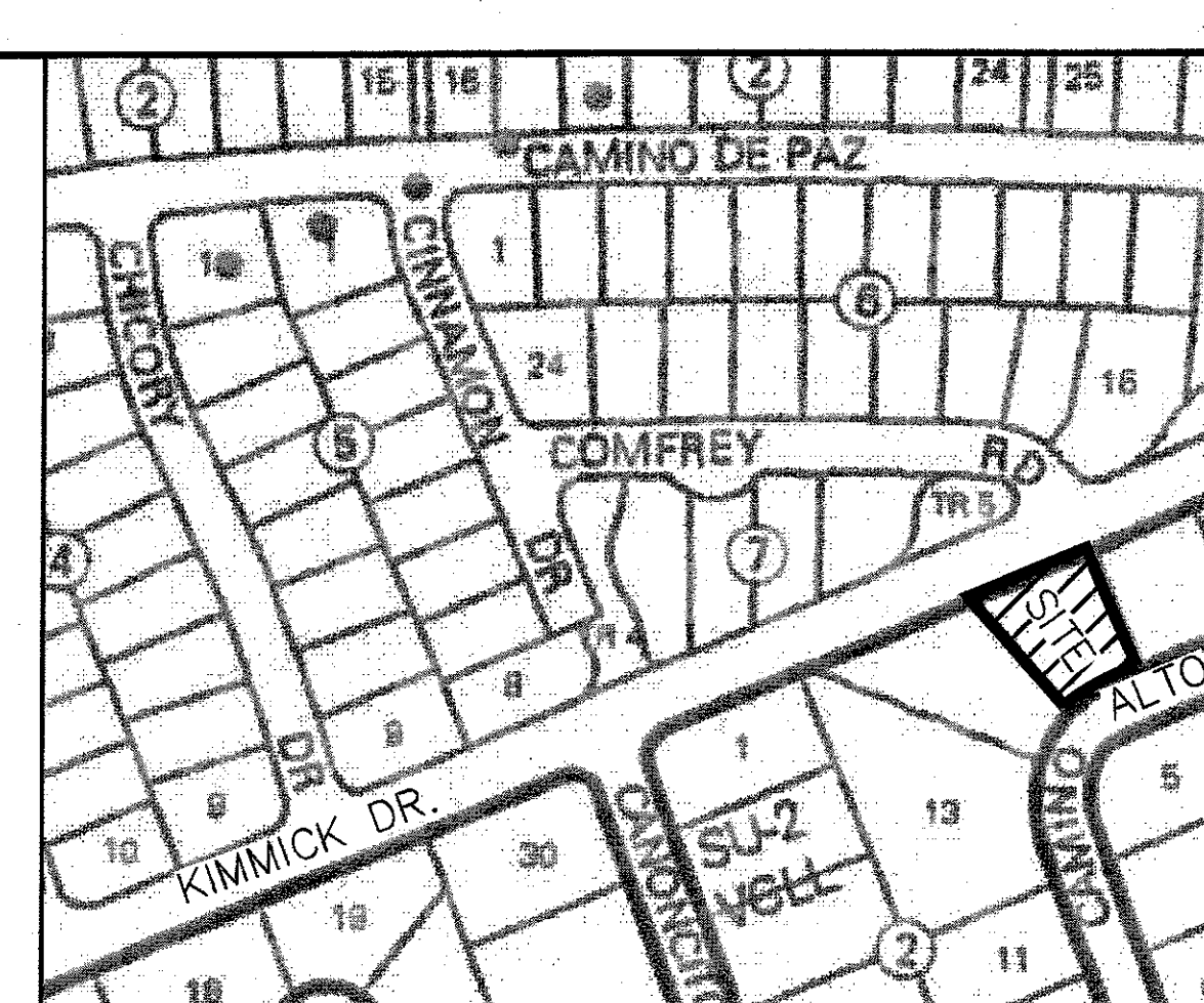
VICINITY MAP ZONE MAP: D-10-Z

LEGAL DESCRIPTION UNIT 22, BLOCK 2, LOT 15 OF THE VOLCANO CLIFFS SUBDIVISION, BERNALILLO COUNTY, NEW MEXICO AS SAID LOT IS SHOWN AND DESIGNATED ON THE PLAT THEREOF FILED IN THE OFFICE OF THE COUNTY CLERK OF, BERNALILLO COUNTY, NEW MEXICO ON JULY 9, 1975, VOL. D6, FOLIO 162.