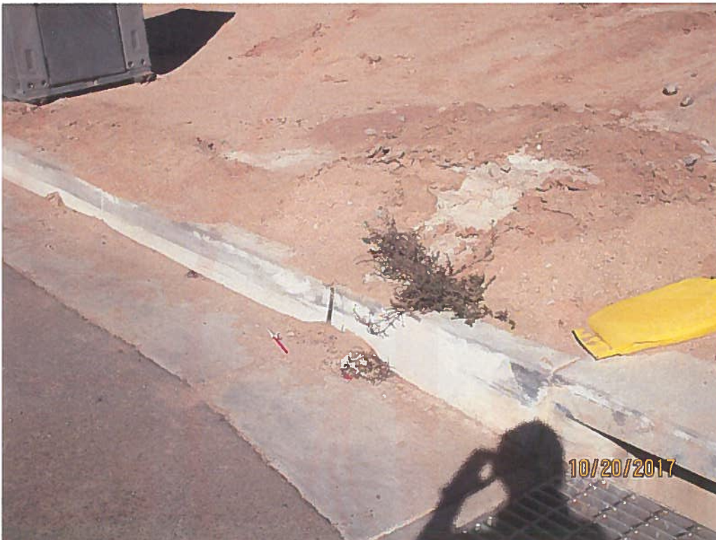
Wash-out in front yard.