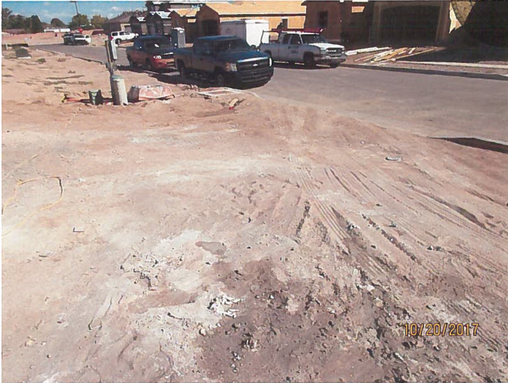
Wash-out and dry cementitious material in front yard.