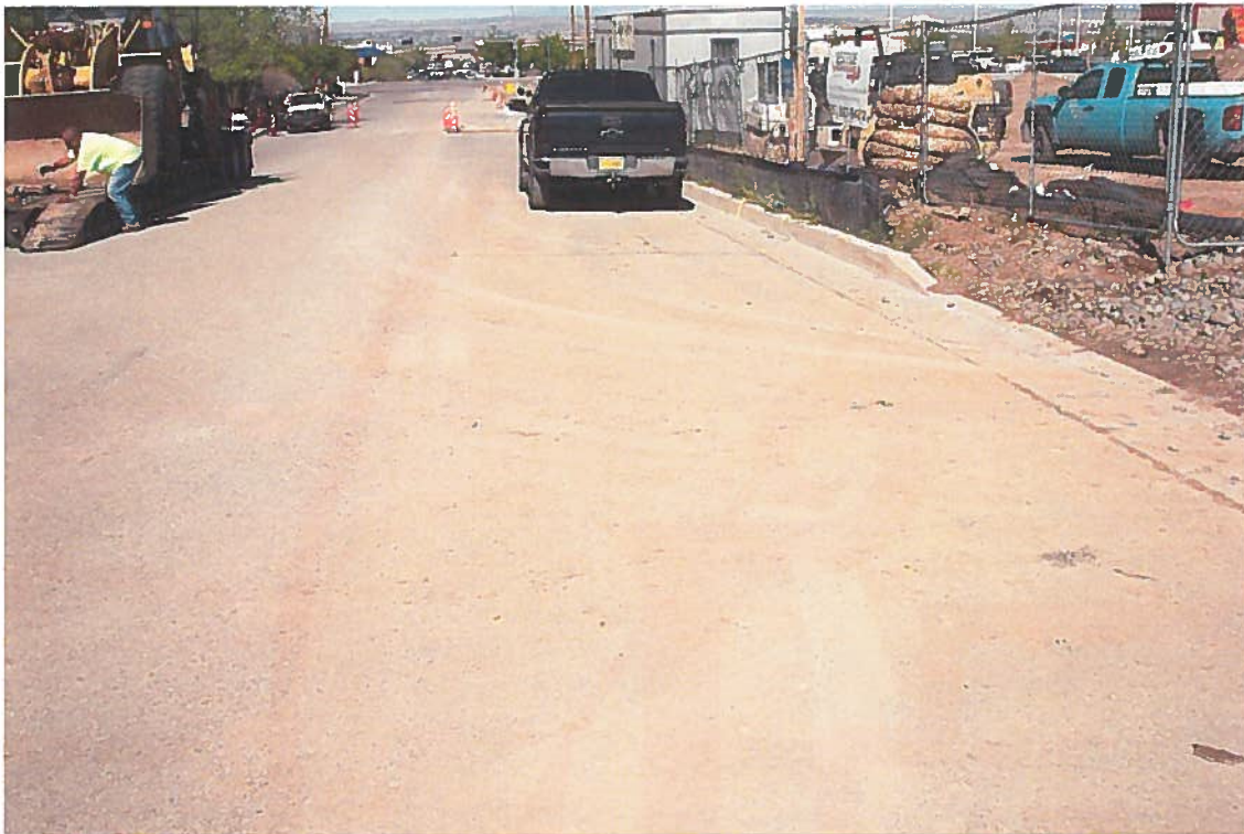
Sediment in Palomas Ave 4-24-19.