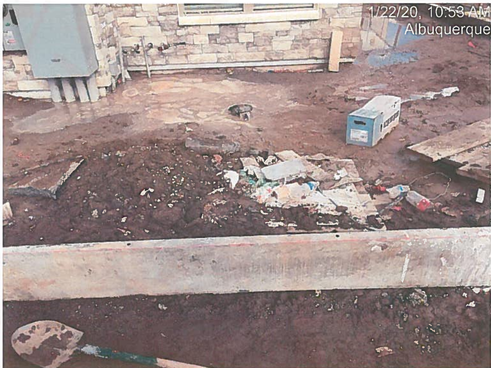
Washout and waste