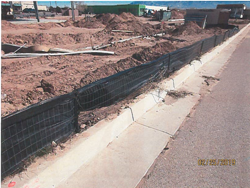
Silt fence not buried along southern edge.