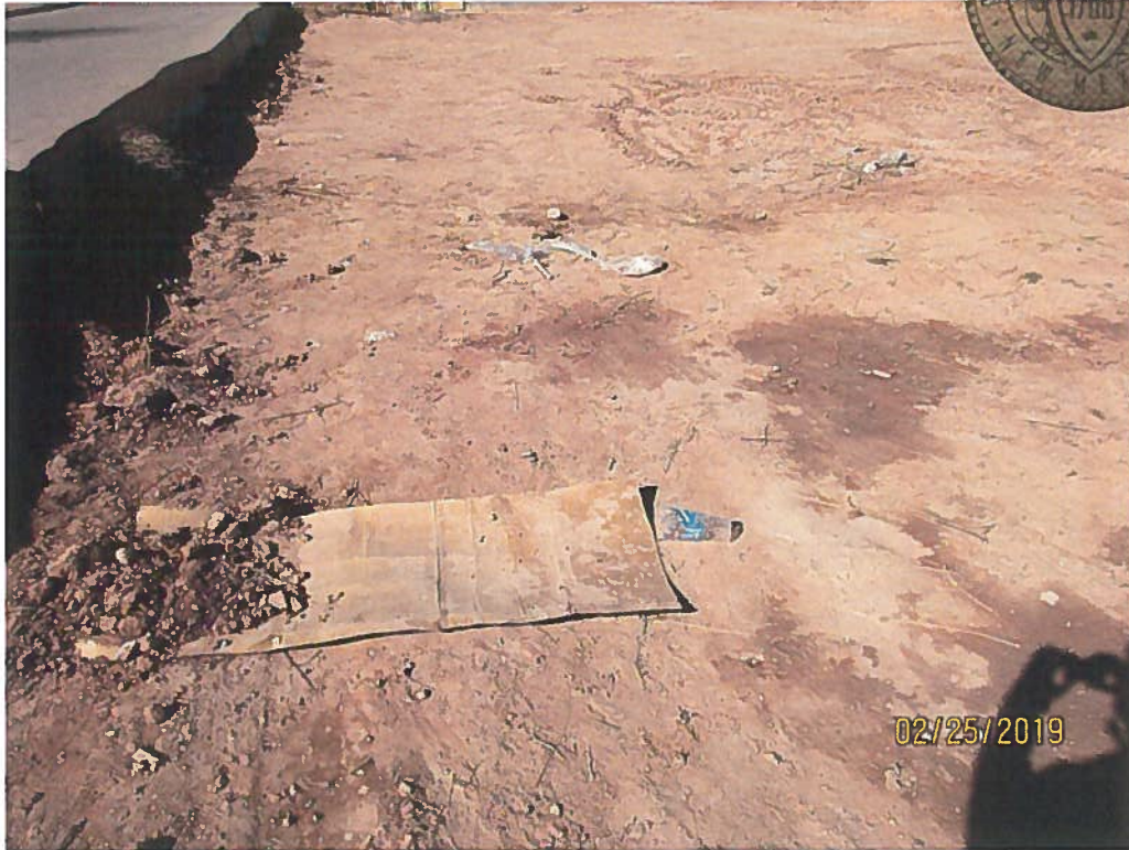
Construction site wastes not in an acceptable container.