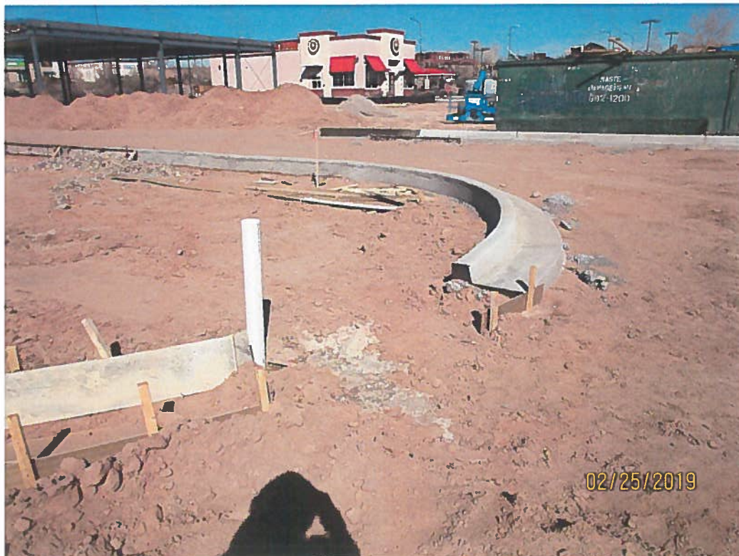
Wash-out in the dirt.