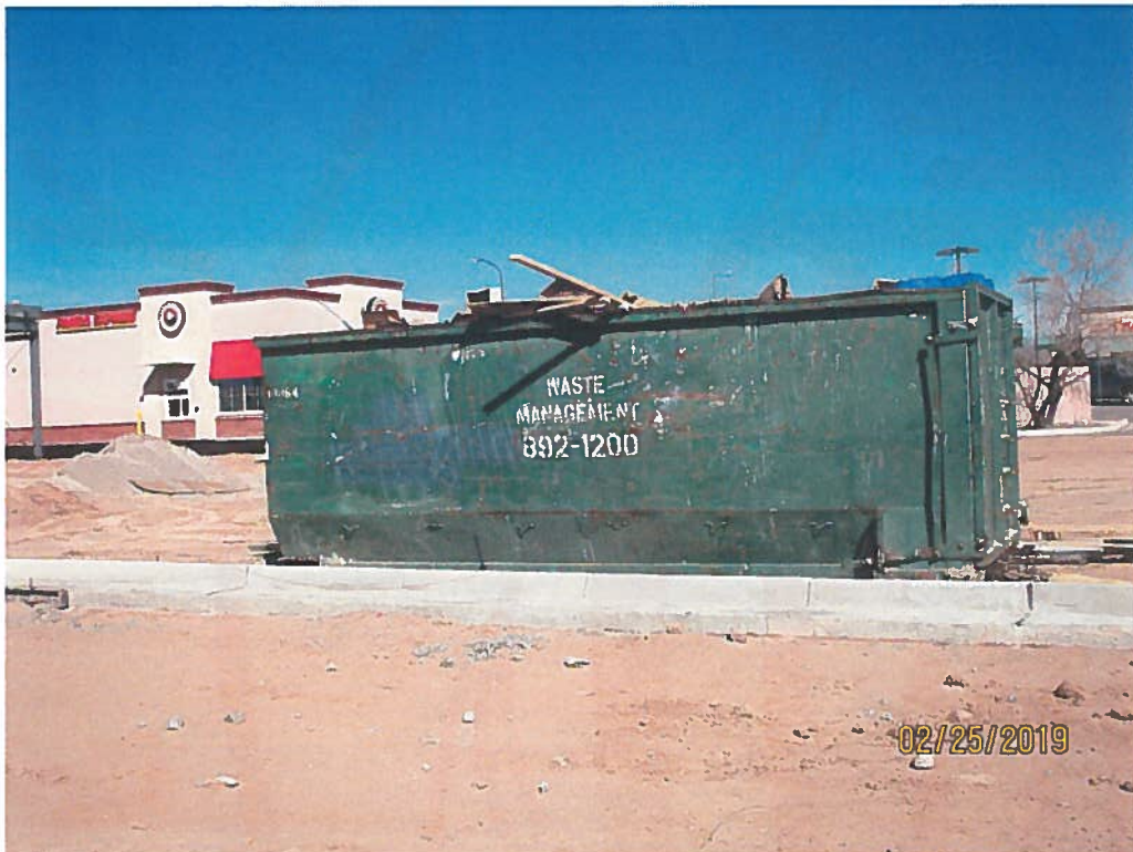
Waste container full and not covered.