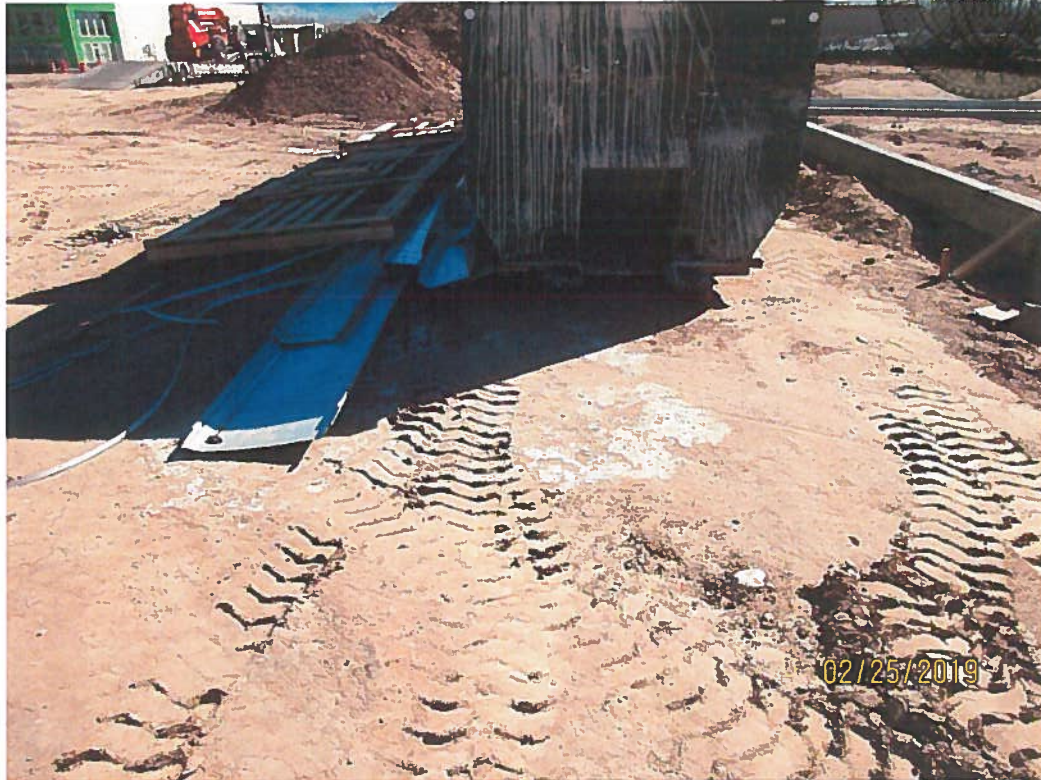
Wash-out in the dirt.