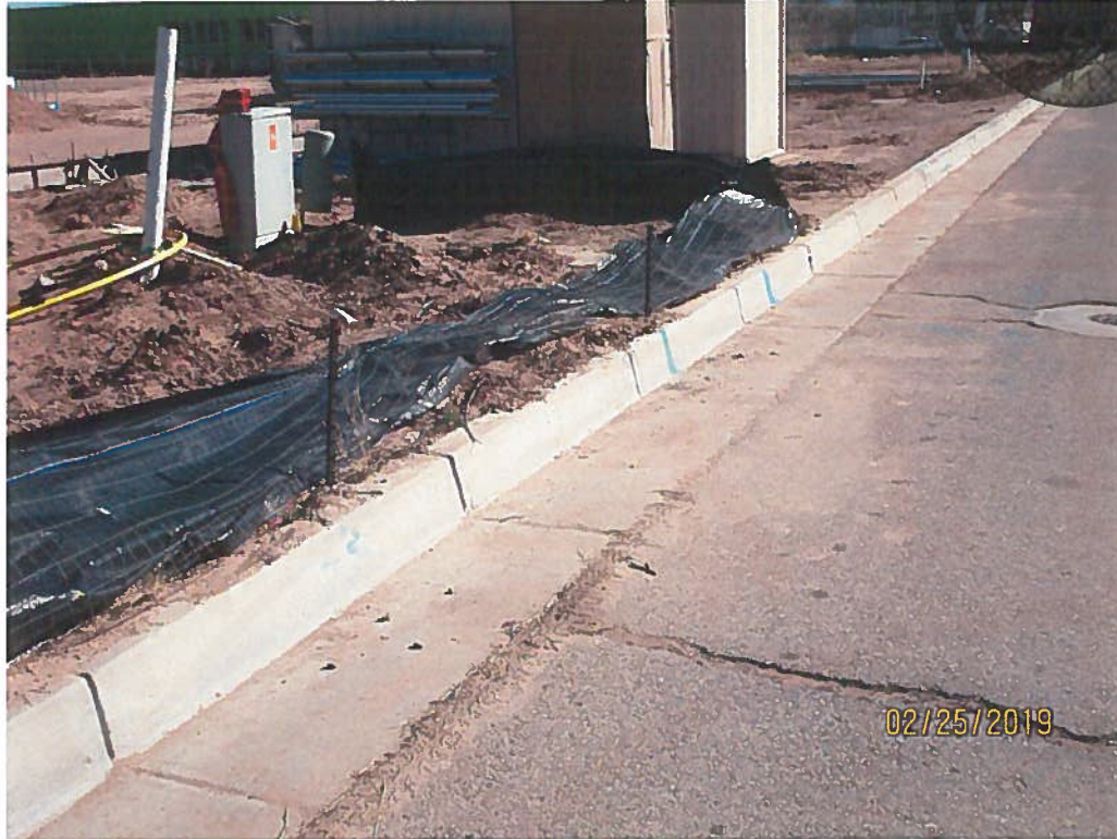
Silt fence down along southern edge.