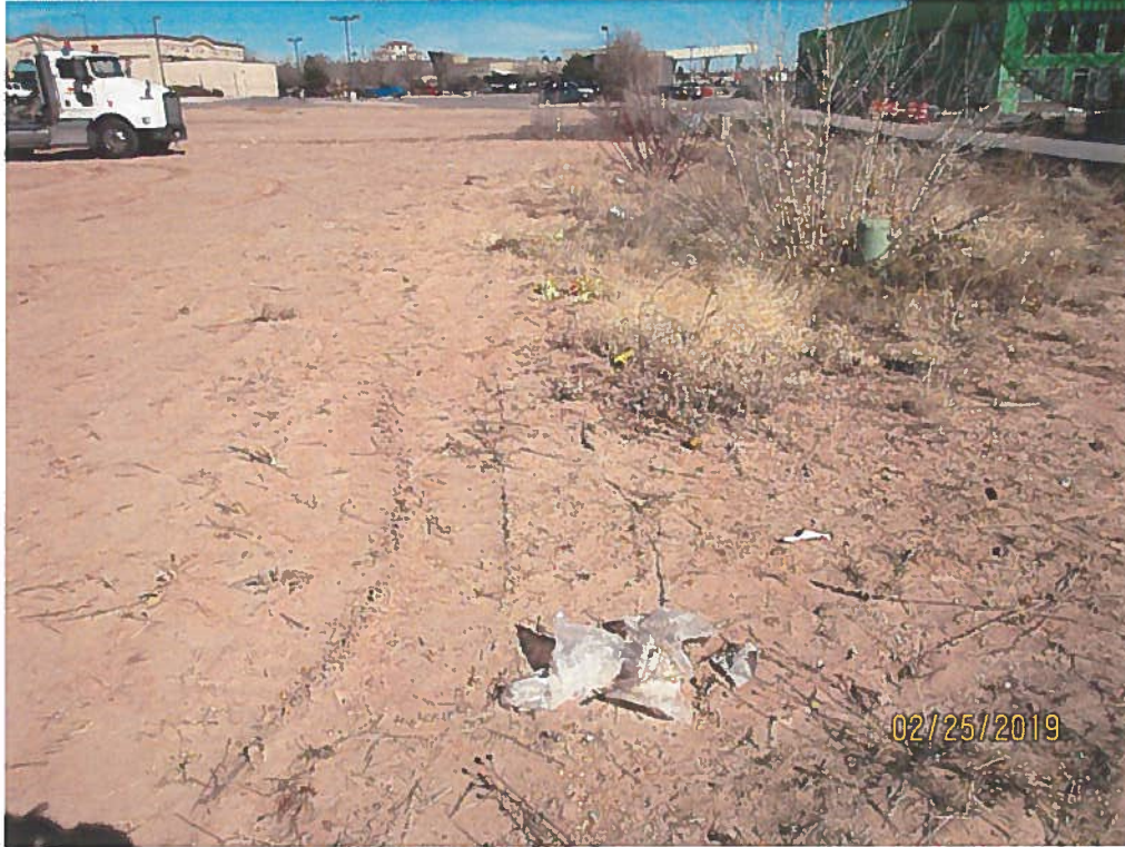
Construction site wastes not in an acceptable container.