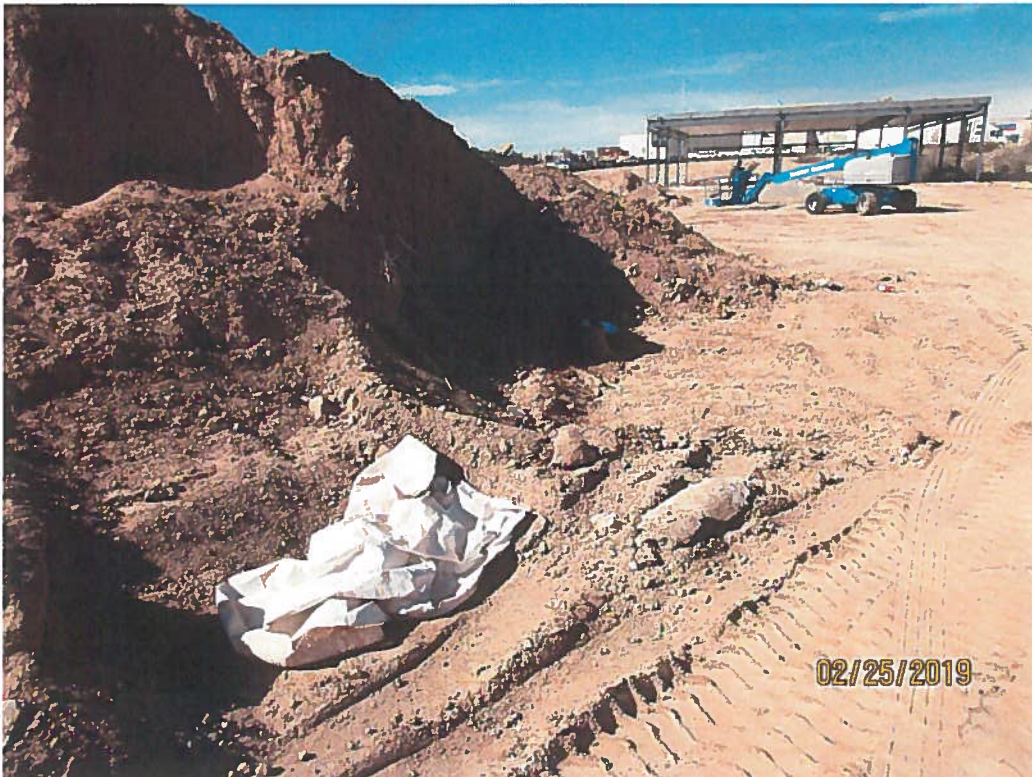
Construction site wastes not in an acceptable container.