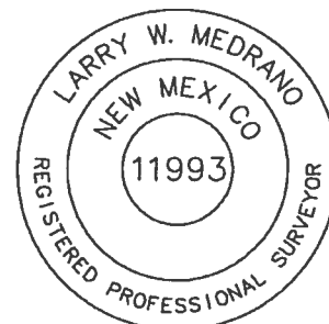
Exhibit B Page 1 of 2