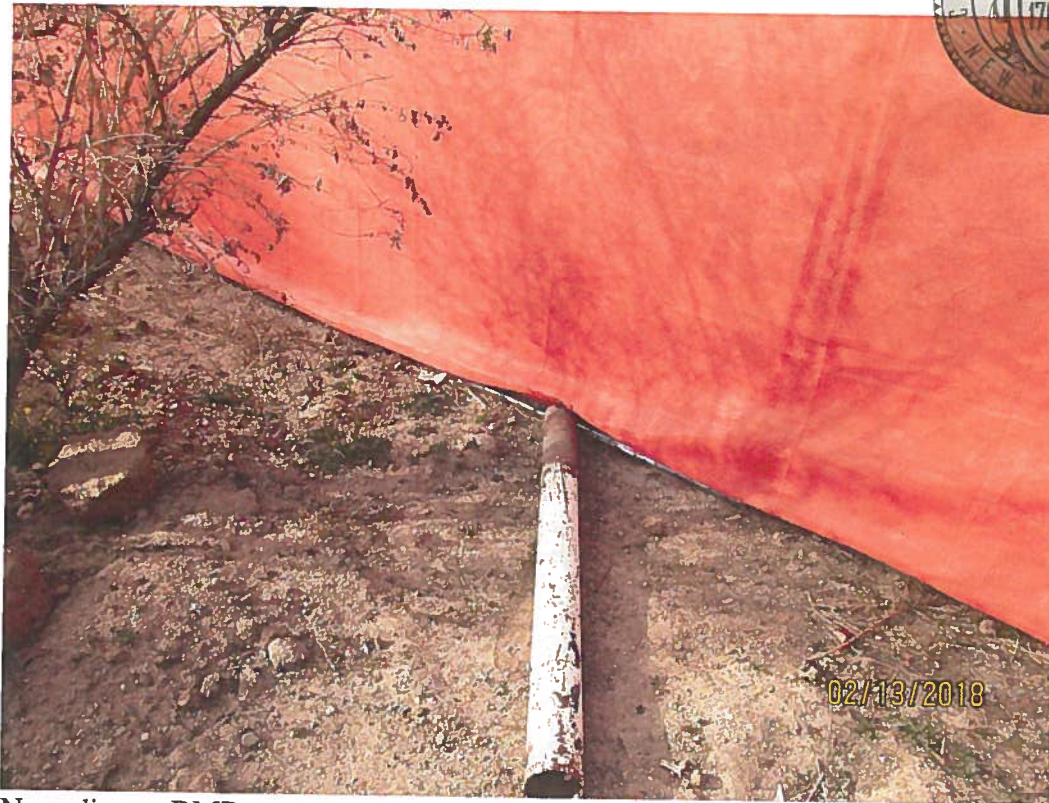
No sediment BMP.