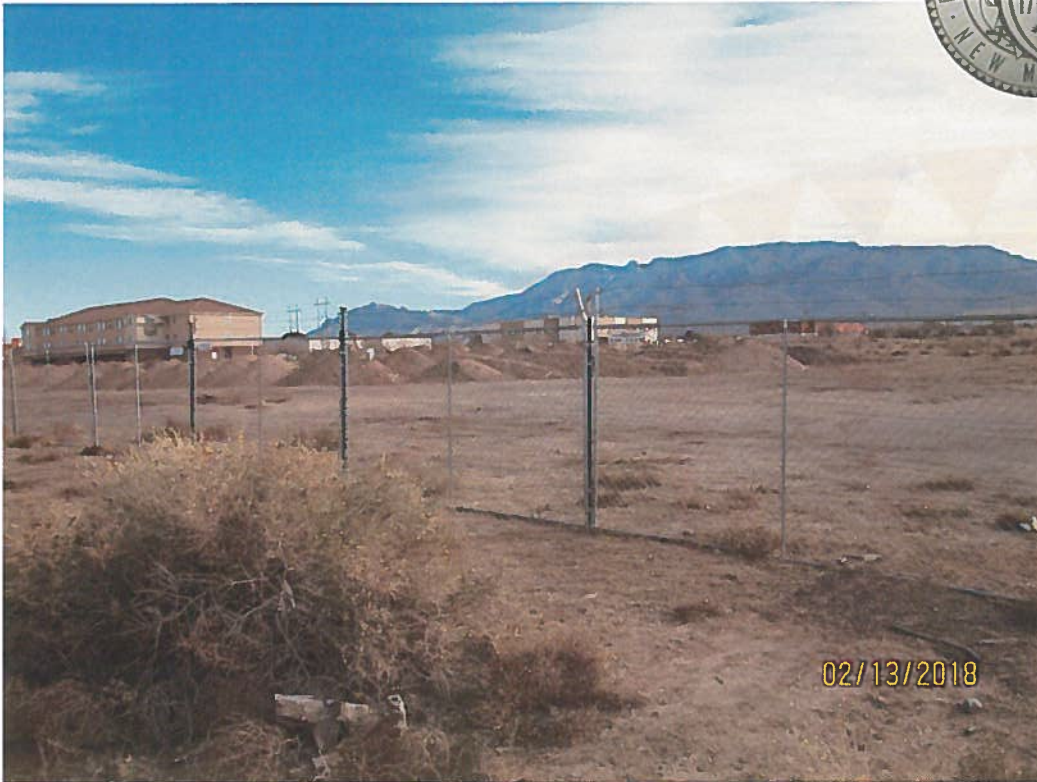
Stockpiles on site south of arroyo.