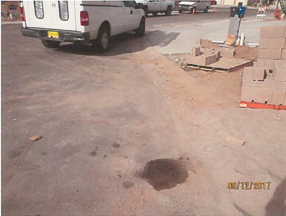
Sediment in street.