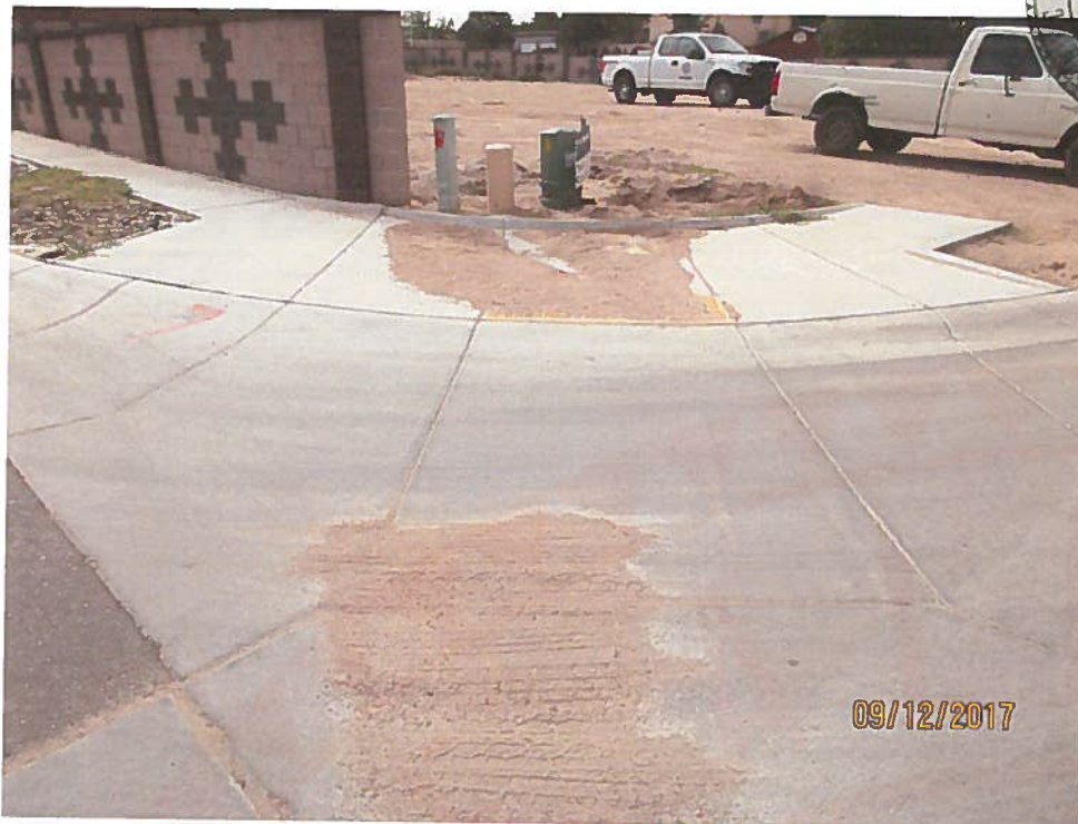
No sediment BMP and sediment in street and on ADA ramp.