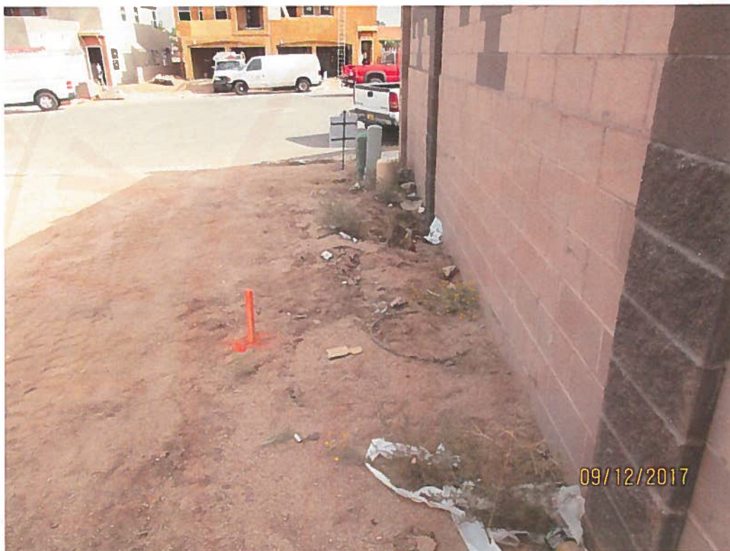
Trash on lot.