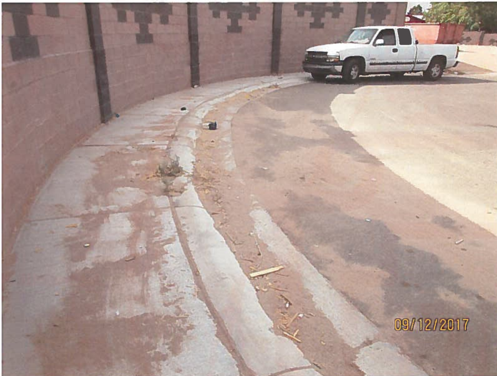
Sediment on sidewalk and in street.