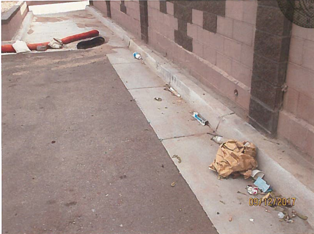
Trash in gutter immediately upstream of channel.