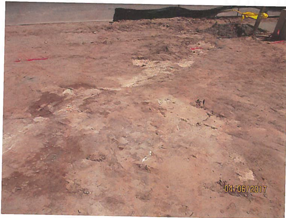
Cement pollution (stucco) at house 5008 San Adan.