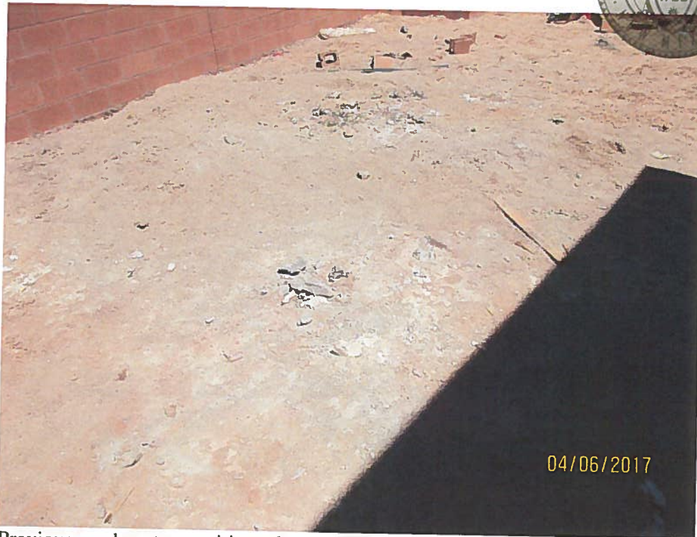
Previous wash-out not mitigated.