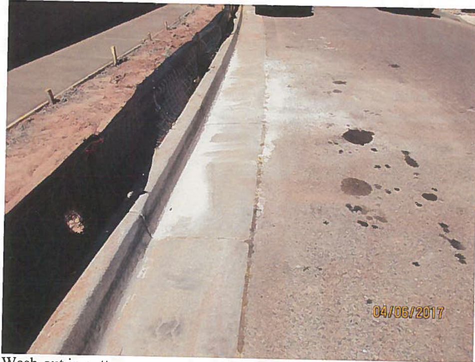
Wash-out in gutter.