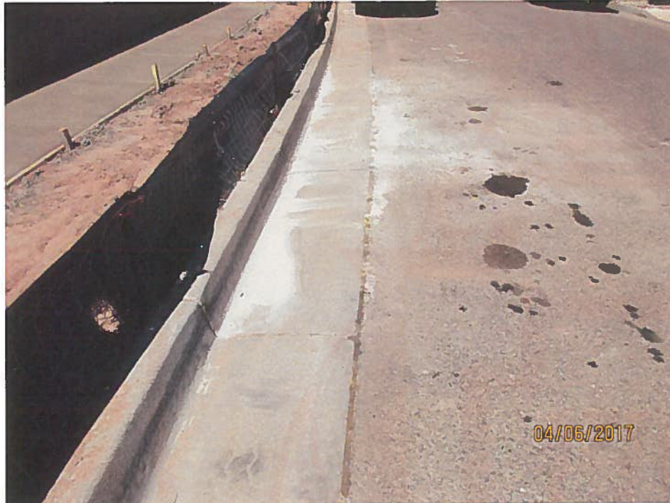
Wash-out in gutter.