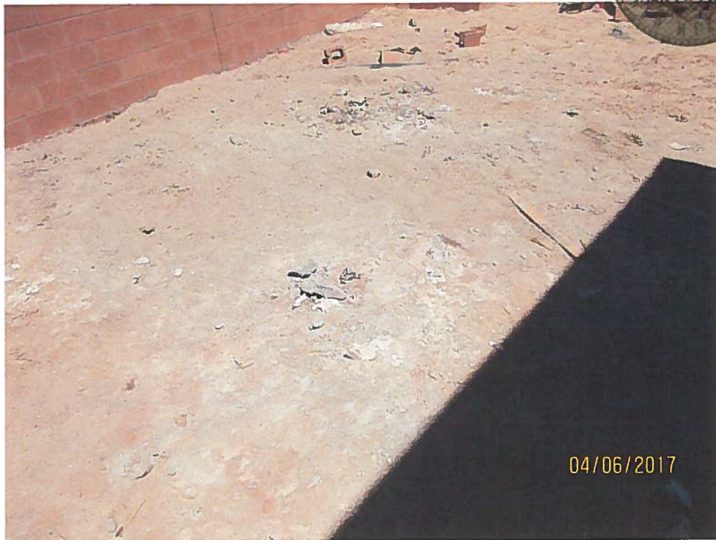
Previous wash-out not mitigated.