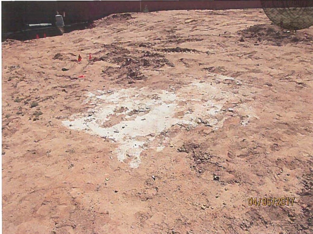
Cement pollution at house near Marbella and Sacate.