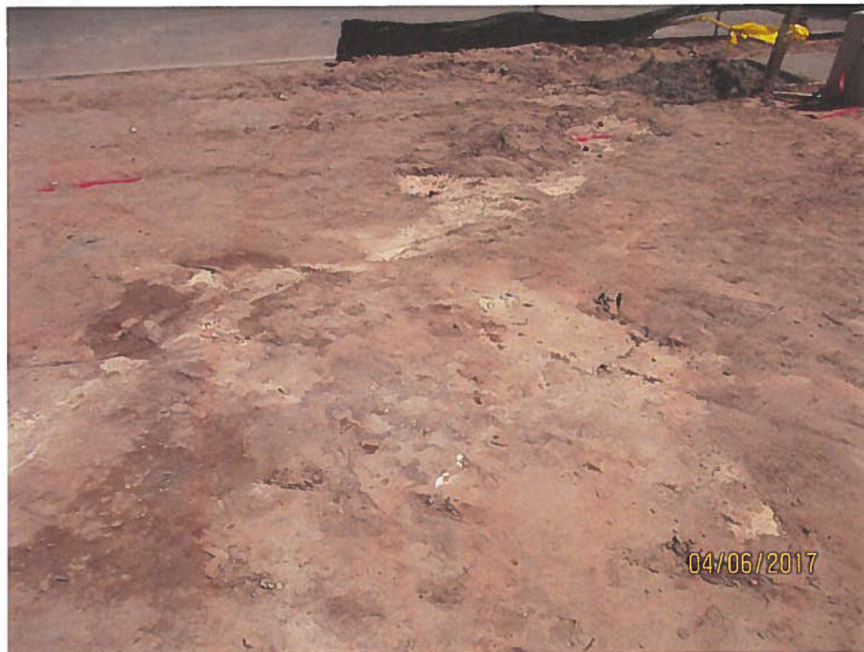
Cement pollution (stucco) at house 5008 San Adan.