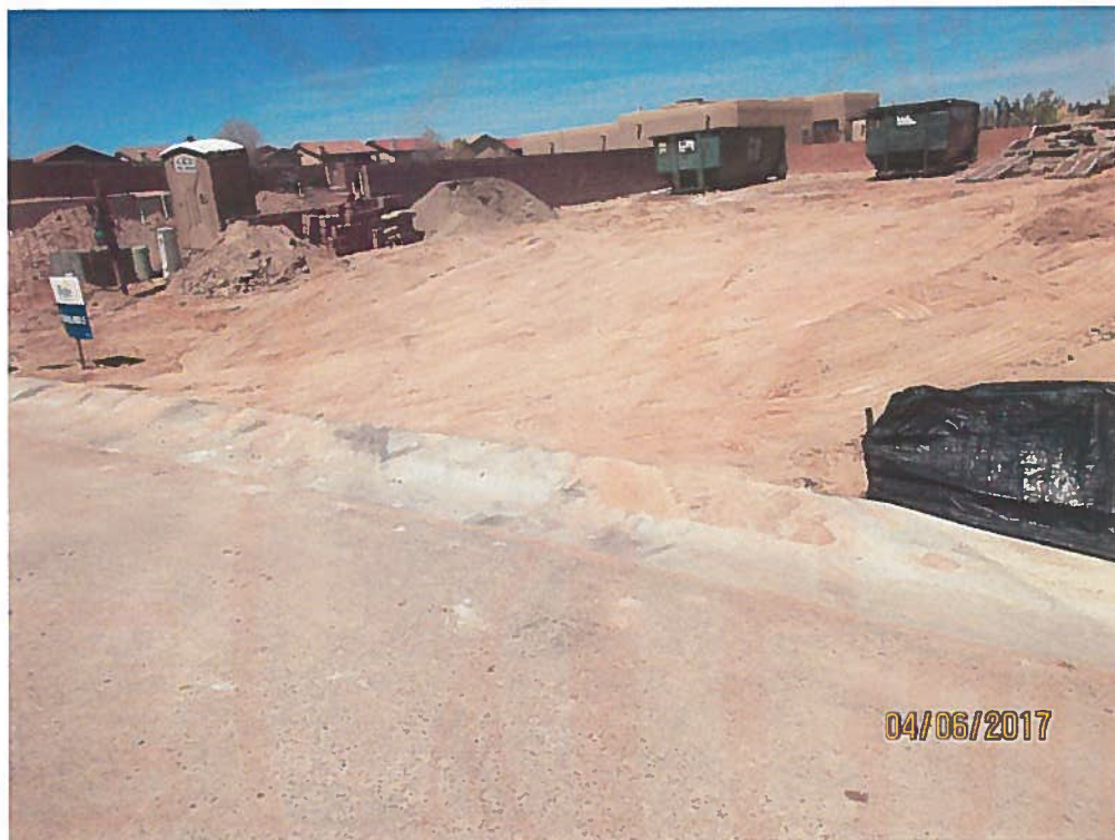
In addition to the cement pollution, the subdivision wash-out and trash receptacle did not have a track-out pad.