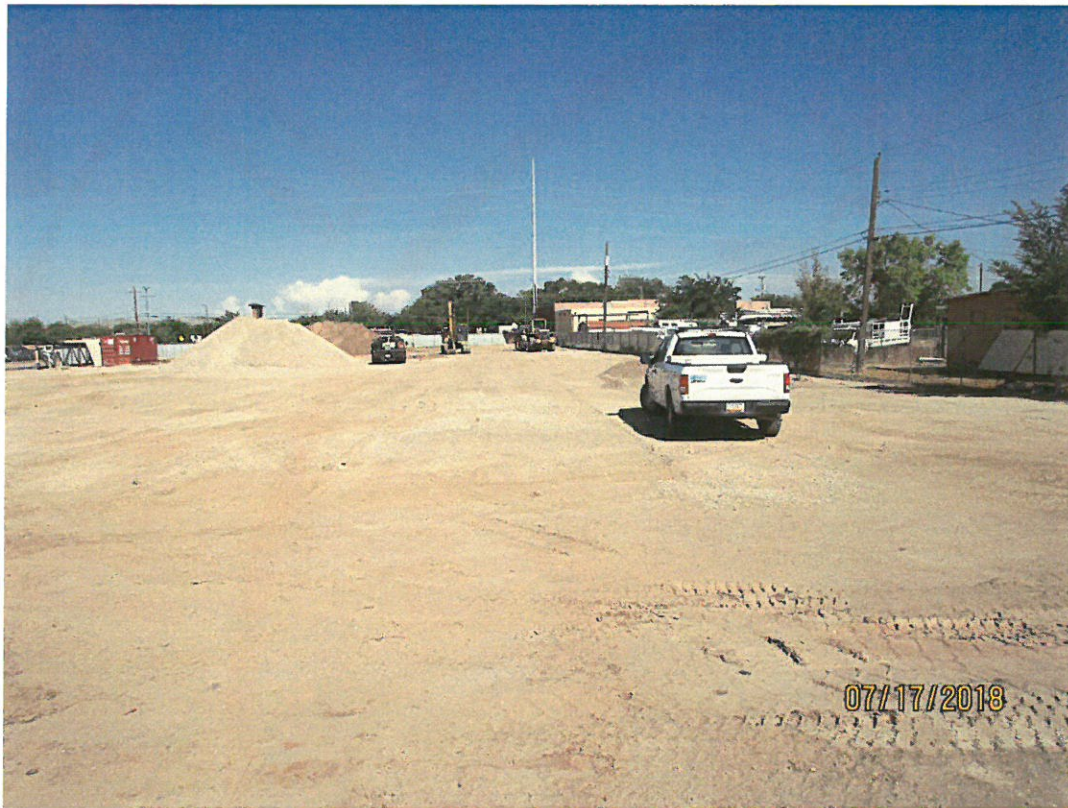
Rough graded site.