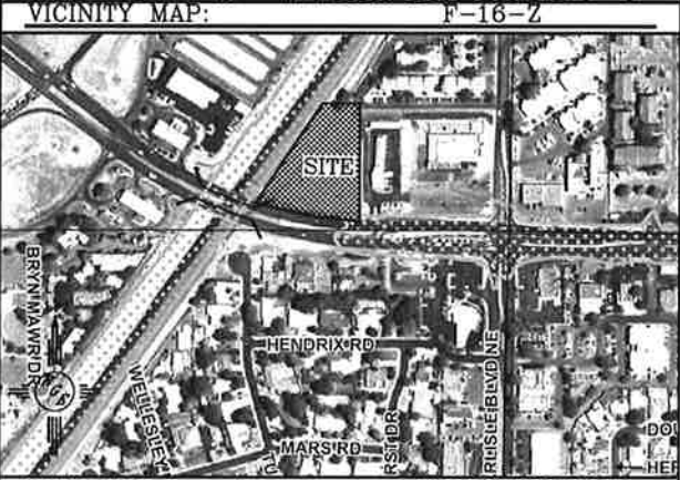
VICINITY MAP: F-16-2