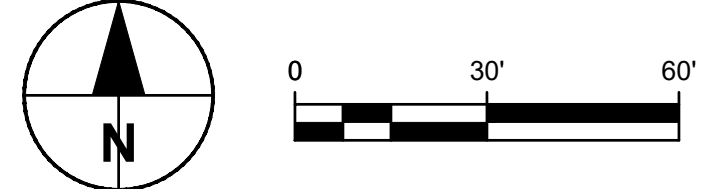
SITE PLAN Scale 1"=30'

TRAFFIC CIRCULATION LAYOUT APPROVED Sertil A. Kanbar 12/18/2025 Signed Date