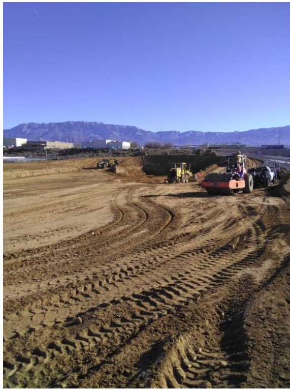
SW corner looking NE, 1-8-19