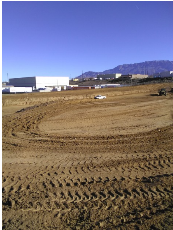
SW corner looking NE, 1-8-19