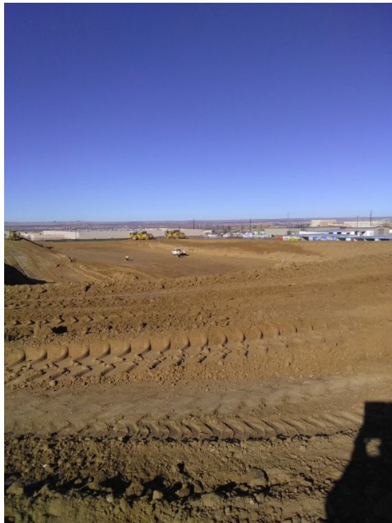
SE corner looking West 1-8-19