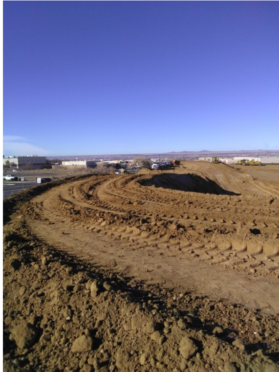
SE corner looking West 1-8-19