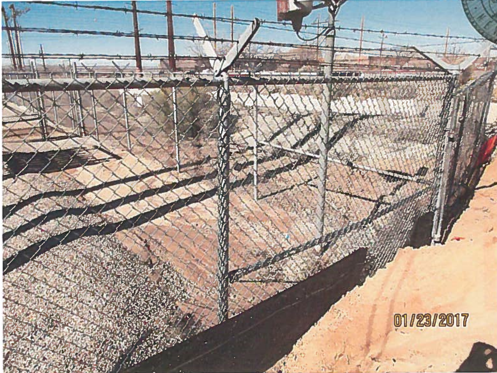
Gap in silt fence and sediment on adjacent property.