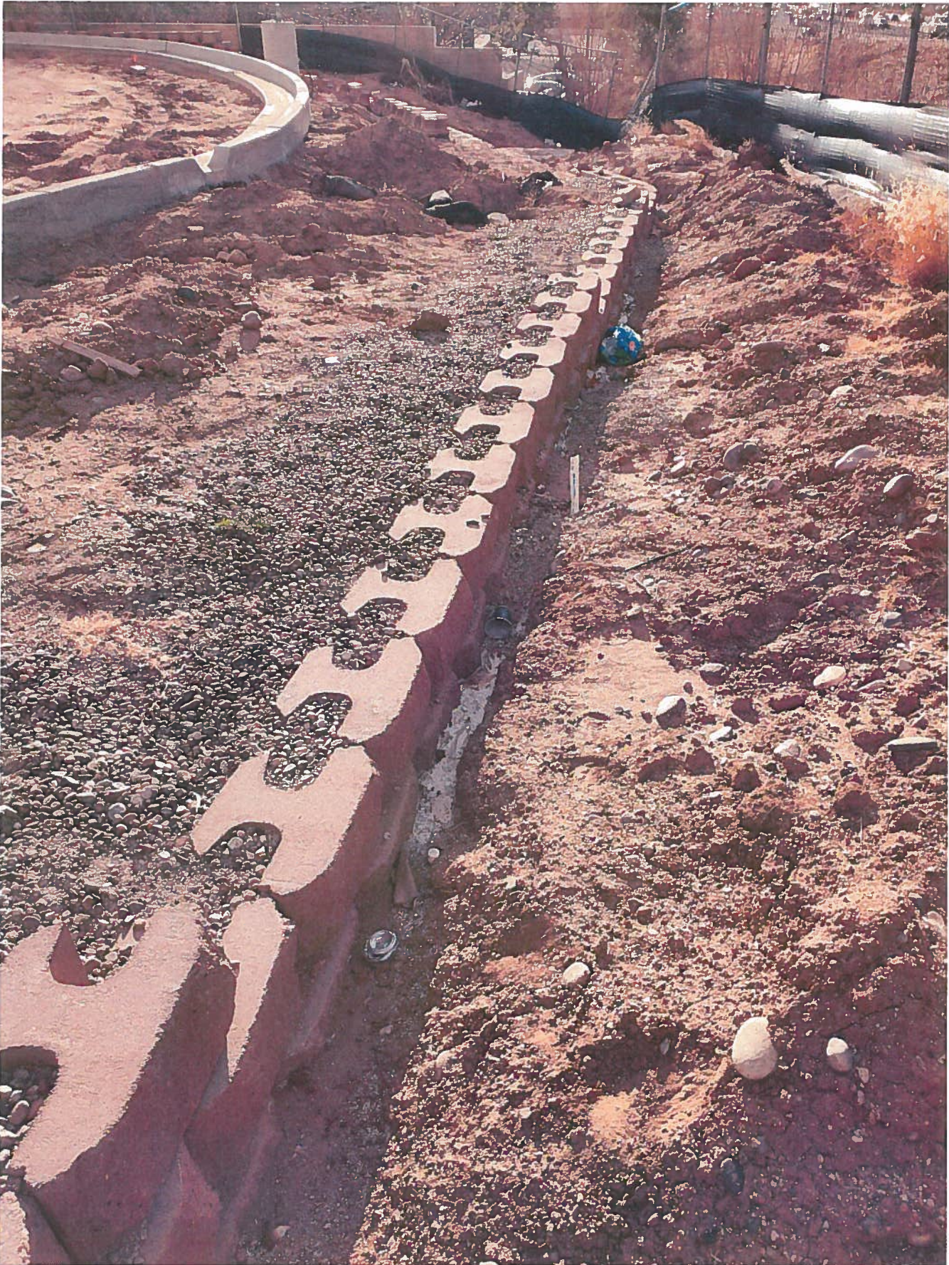
Rasping and Waste