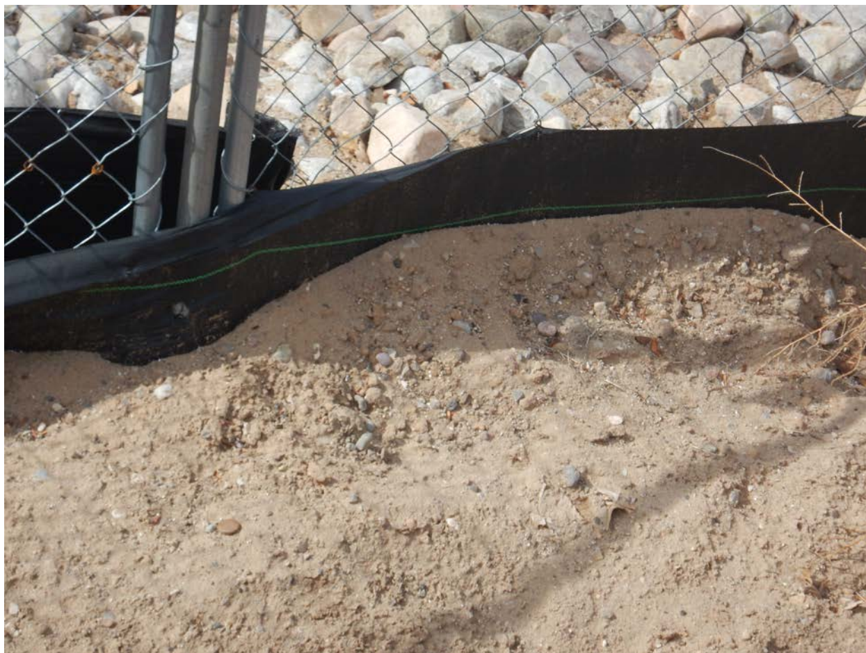
View of accumulated earthen material against existing silt fencing. January 29, 2020 12:56 PM (DSCN 1696).