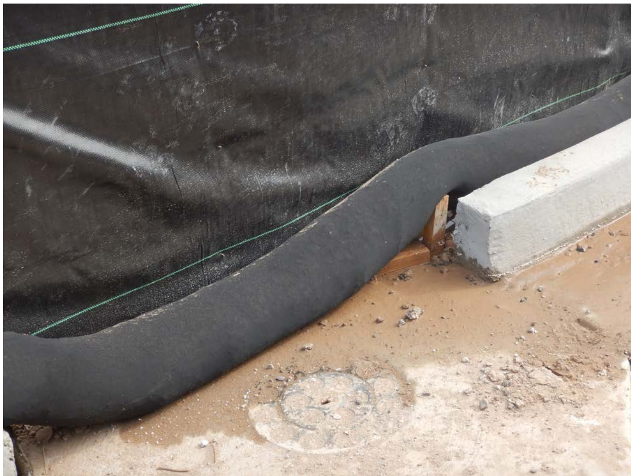
View of potential run-on location from adjacent up gradient property. January 29, 2020 1:06 PM (DSCN 1711).