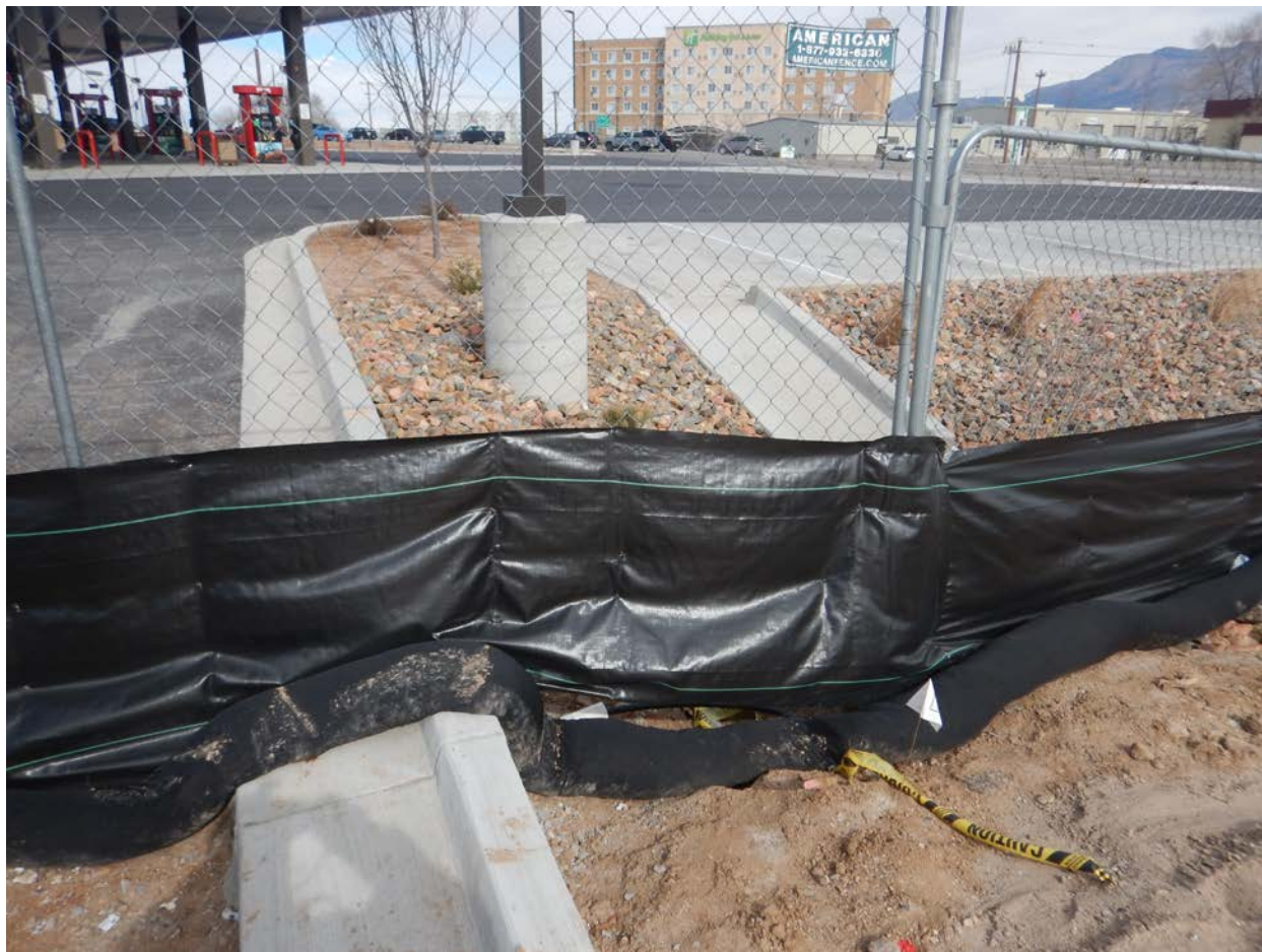
View of potential run-on location from adjacent up gradient property. January 29, 2020 1:11 PM (DSCN 1713).