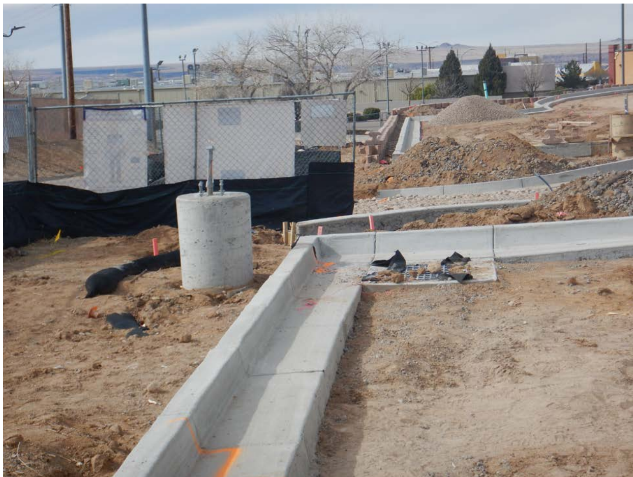
Picture of the drop drain located at the approximate northeast corner of the site entrance and lighting stanchion. January 29, 2020 12:49 PM (DSCN 1690).