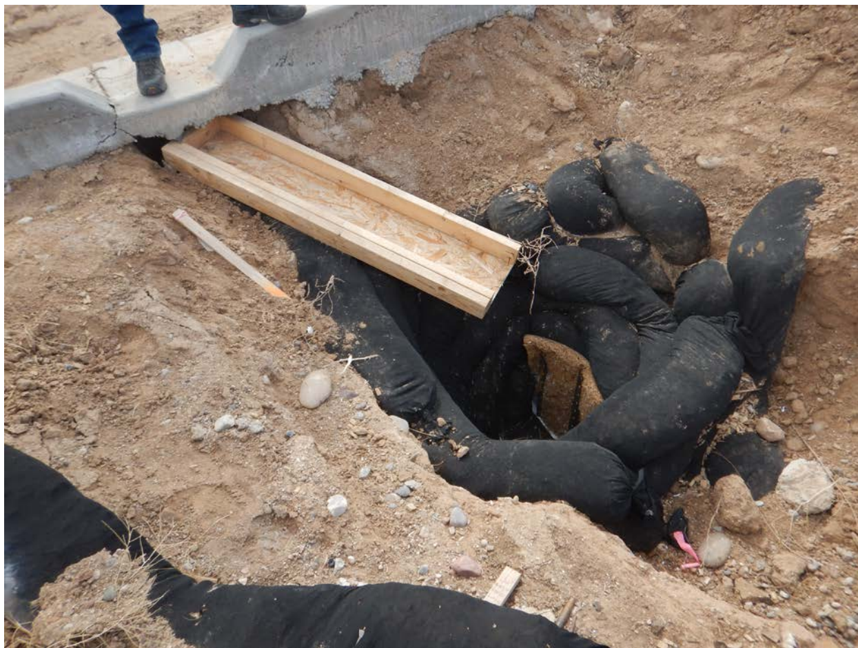
Picture of wattle lined drainage structure located at the approximate southwest corner of the building and outside the curb and gutter. January 29, 2020 1:03 PM (DSCN 1708).