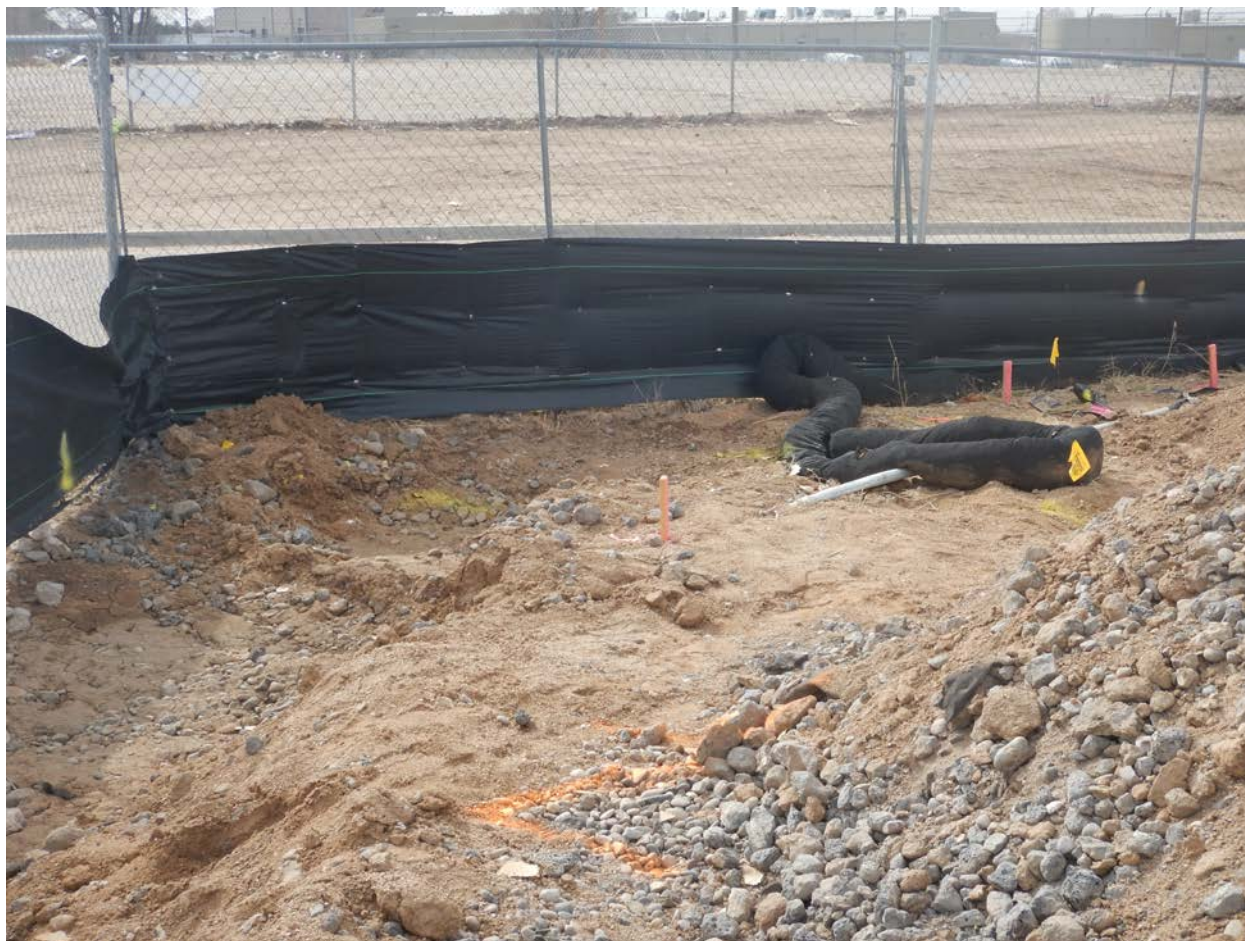
View along the curb and gutter at northwest corner of site entrance potentially being a run-off conduit. January 29, 2020 12:52 PM (DSCN 1696).