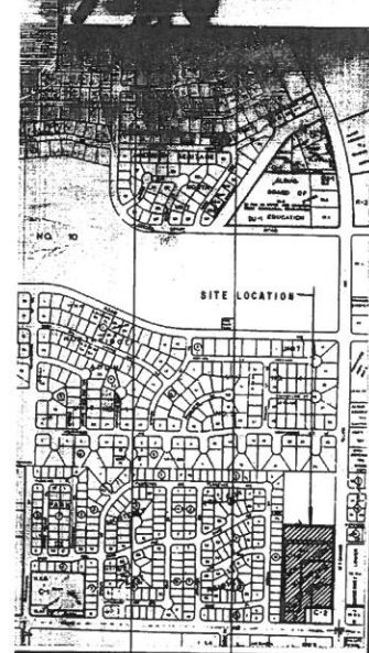
VICINITY MAP SCALE: 1"=800' (Approx.)