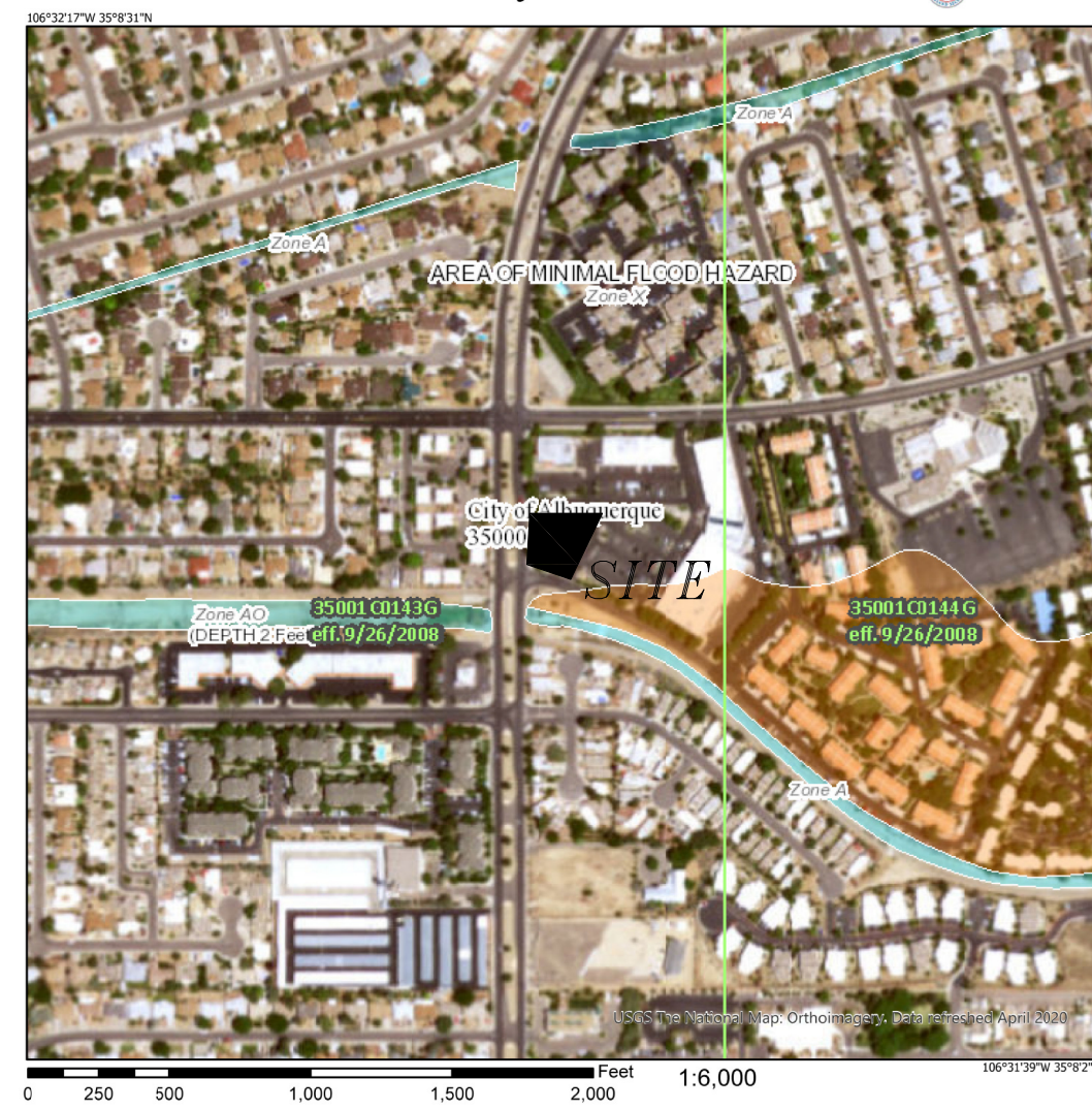
National Flood Hazard Layer FIRMette