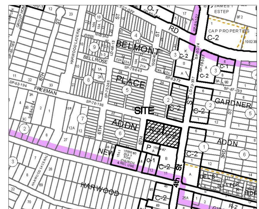
VICINITY MAP Zone Atlas G-14 NTS

CAUTION - NOTICE TO CONTRACTOR THE CONTRACTOR IS SPECIFICALLY CAUTIONED THAT THE LOCATION AND/OR ELEVATION OF EXISTING UTILITIES AS SHOWN ON THESE PLANS IS BASED ON RECORDS OF THE VARIOUS UTILITY COMPANIES AND, WHERE POSSIBLE, MEASUREMENTS TAKEN IN THE FIELD. THE INFORMATION IS NOT TO BE RELIED ON AS BEING EXACT OR COMPLETE. THE CONTRACTOR MUST CALL NEW MEXICO ONE CALL (811) AT LEAST 48 HOURS BEFORE ANY EXCAVATION TO REQUEST EXACT FIELD LOCATION OF UTILITIES. IT SHALL BE THE RESPONSIBILITY OF THE CONTRACTOR TO RELOCATE ALL EXISTING UTILITIES WHICH CONFLICT WITH THE PROPOSED IMPROVEMENTS SHOWN ON THE PLANS.