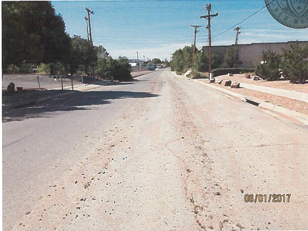
Track-out on Vassar extending a long distance to the south. Track-out extended approximately ½ mile from site.