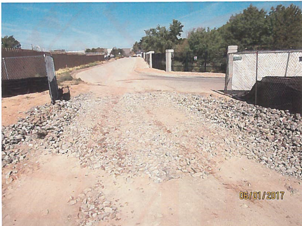
Track-out pad requires maintenance/reinstallation.