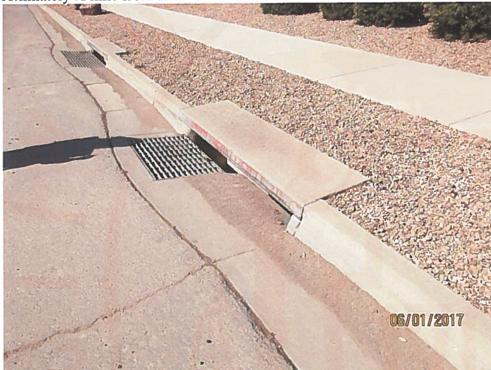
Inlet on Vassar Dr with sediment.