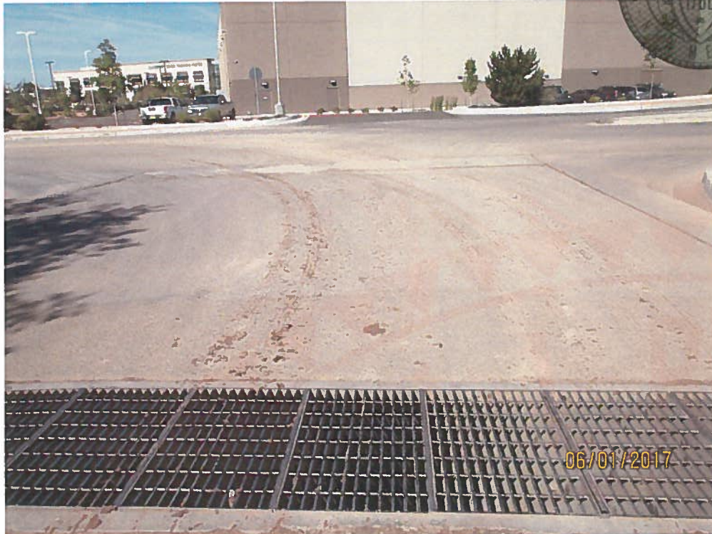
Track out at Vassar Dr and Pathway Ave.