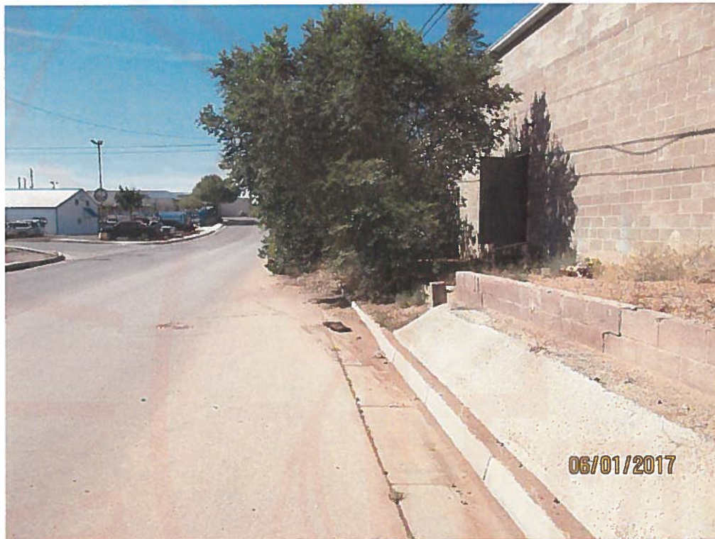
End of sediment removal from street, gutter and sidewalks.