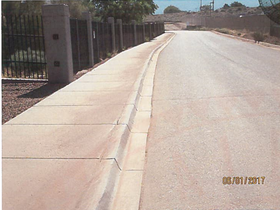
Sediment on sidewalk from previous sweeping.