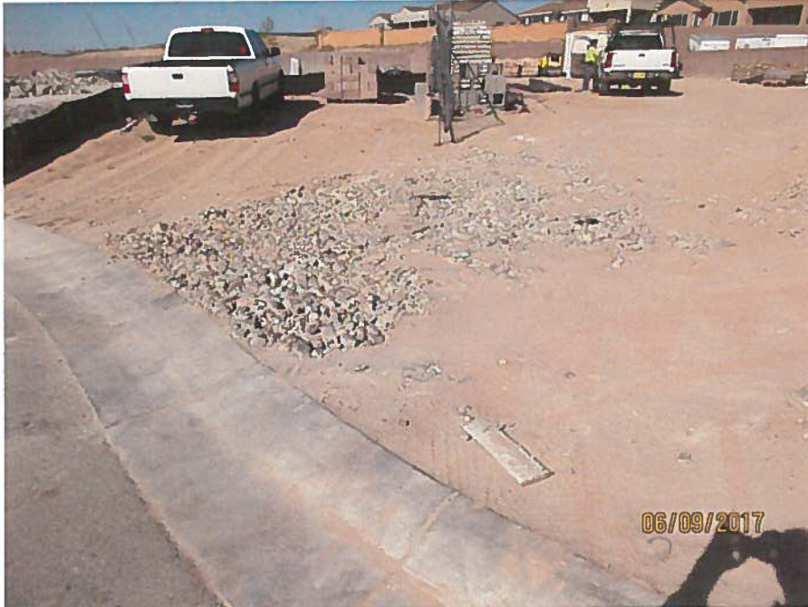
Track-out pad at maintenance yard.