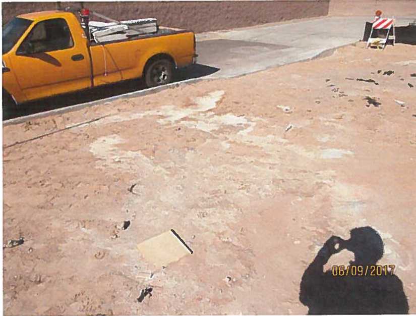
Cement pollution 9255 Timber Ridge NW.