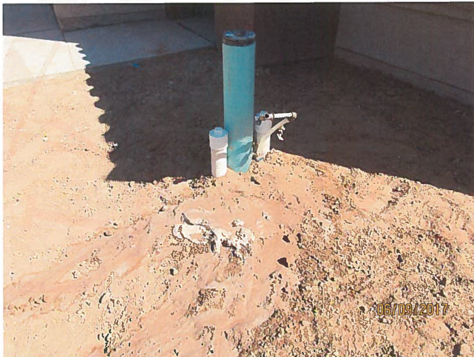
Spigot in front yard encouraging wash-out. Typical on all lots.