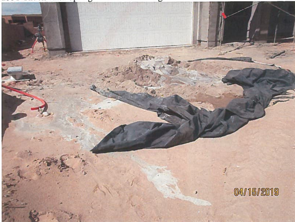
9236 Wind Caves: wash-out on the ground