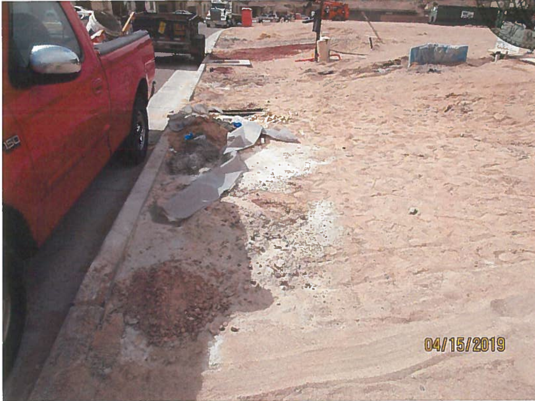
2331 Chuckwalla Spring: wash-out on the ground