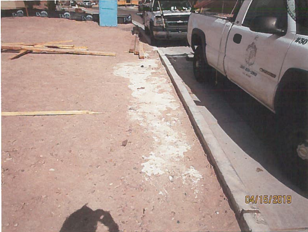
9252 Wind Caves curb-cut slurry on the ground