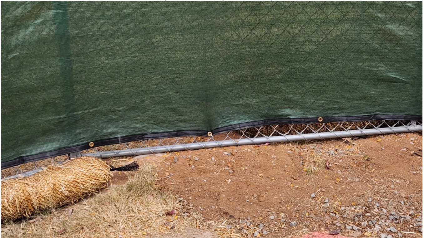
Site Walk Deficiency Photos - South perimeter along Indian school