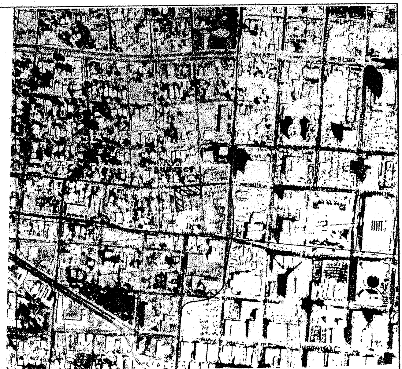
PORTION OF FLOODWAY MAP PANEL 350002 0028

FOR USE WITH DRAINAGE REPORT DATED APRIL 1994