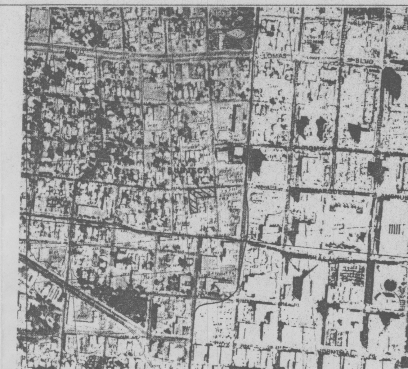
PORTION OF FLOODWAY MAP PANEL 350002 0028

FOR USE WITH DRAINAGE REPORT DATED APRIL 1994