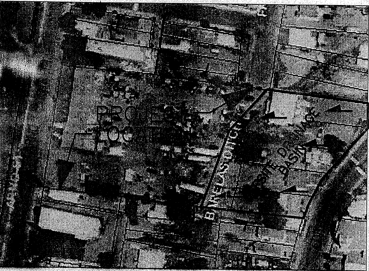
OFFSITE DRAINAGE BASIN MAP

DRAINAGE CERTIFICATION As indicated by the as-built information shown hereon, El Porvenir Subdivision Grading and Drainage plan has been constructed in substantial compliance with the approved Grading and Drainage Plan. The only exception is that a railroad retaining wall was constructed near the east boundary with a railroad tie rundown and cobble stone in order to confine these offsite flows into a channel to minimize sheet flow erosion damage to the east embankment. Calculations are shown on sheet 2 for the rundown. This Certification is presented in fulfillment of drainage requirements requested by the City of Albuquerque. The information shown hereon has been obtained by me or under my direct supervision and is true and correct to the best of my knowledge and belief. Gilbert Aldaz Gilbert Aldaz, NMPE 10848 12-16-04 Date