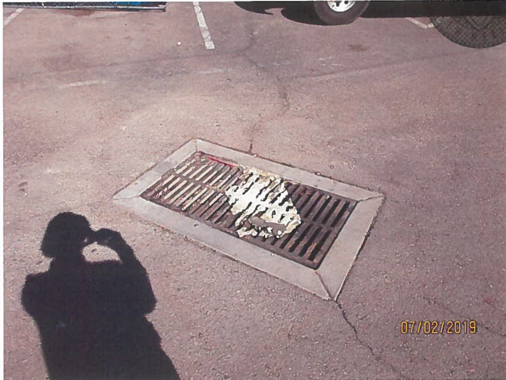
Waste in and on inlet grate – east of south demolition area.