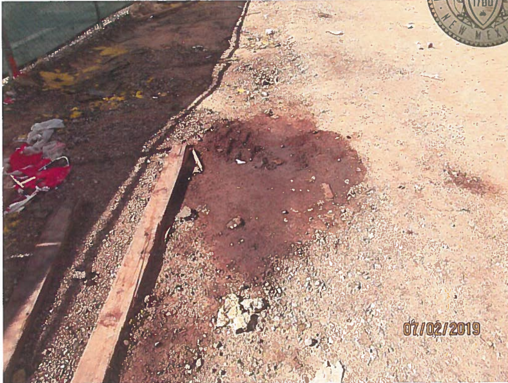
Oil in dirt south demolition area.