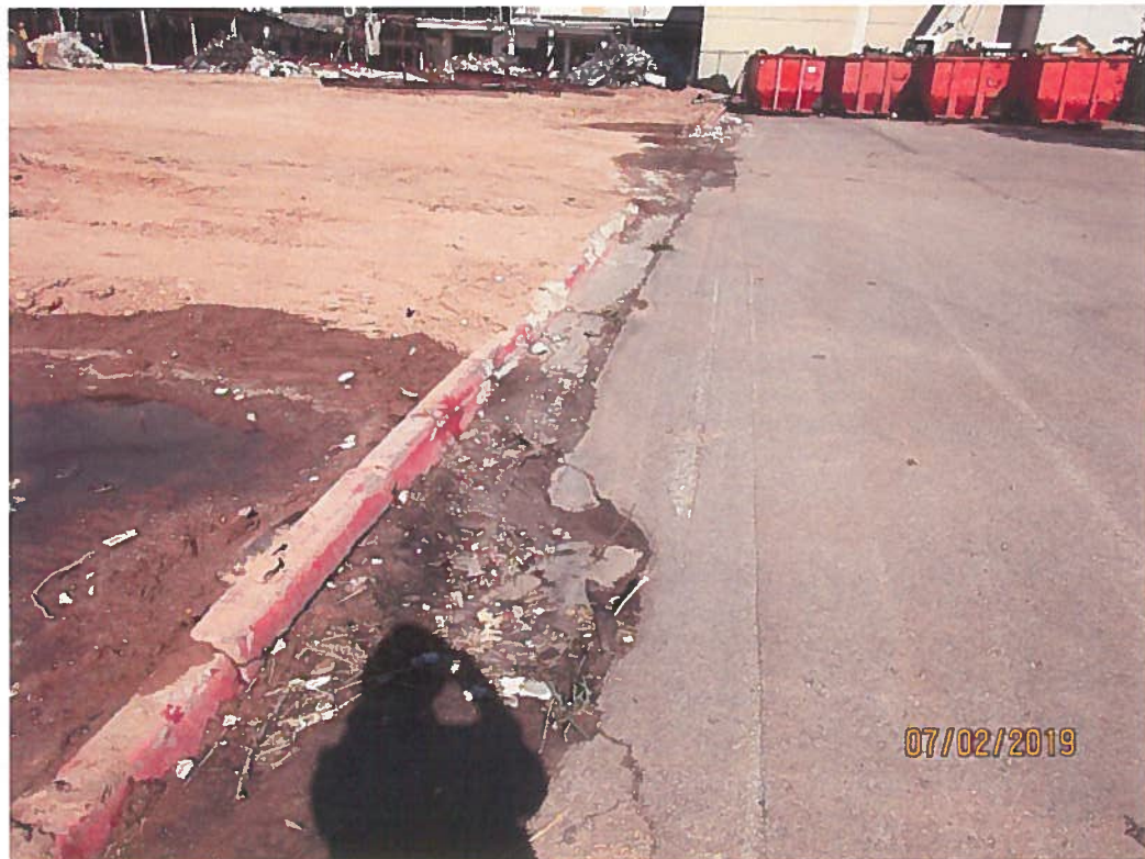
No Vehicle Tracking Control from northeast area of the site.