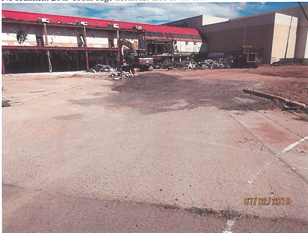
Demolition area in northeast area of the site that drains to an unprotected inlet and to an edge with no sediment BMP.