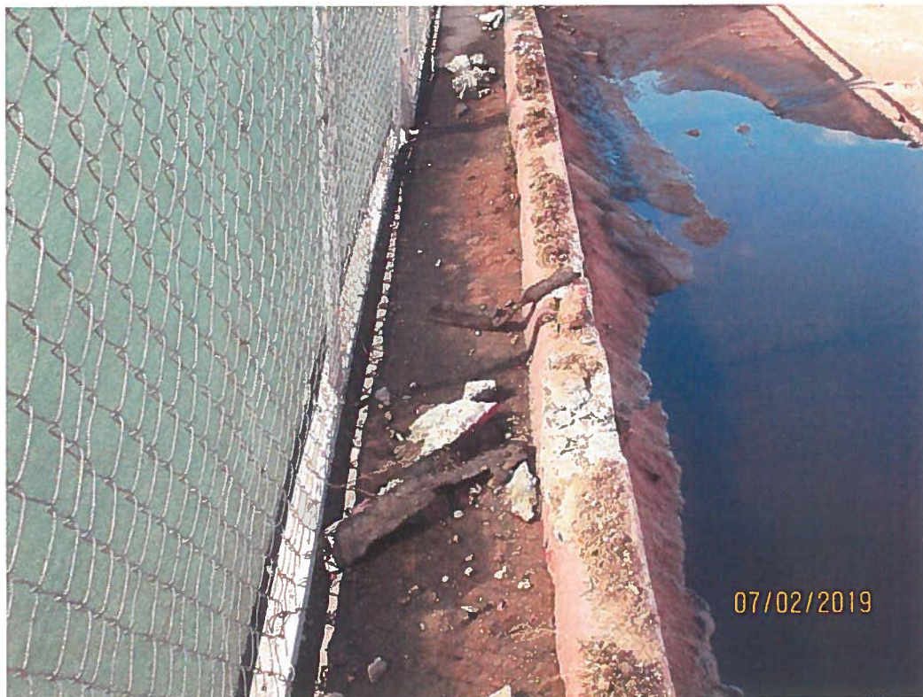
Black sludge and other demolition materials outside BMP.