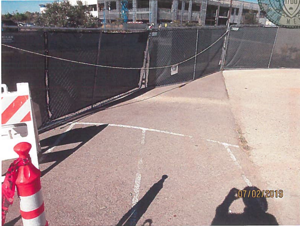
No sediment BMP south edge northeast area of the site.