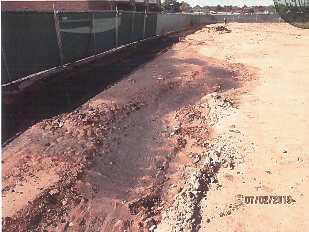
Black sludge that was observed outside of BMPs.