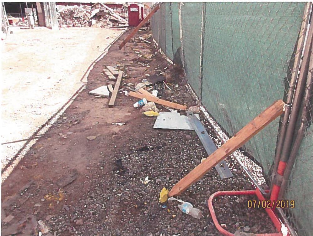
Domestic and construction waste not in an acceptable waste container - demolition area south.