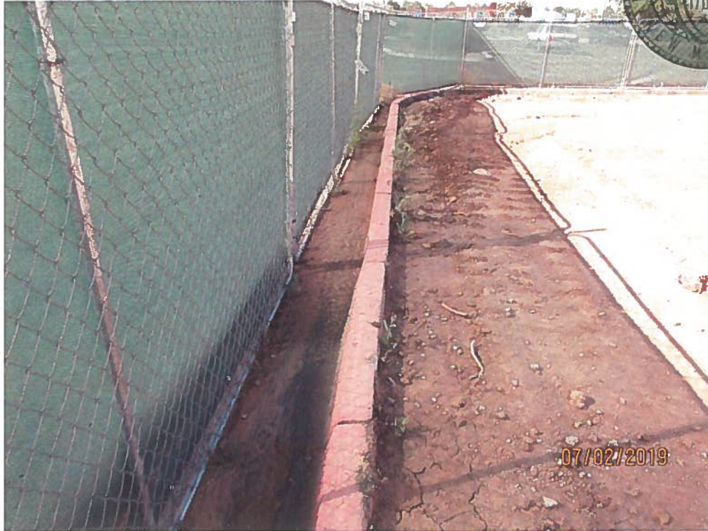
Black sludge and other demolition materials outside BMP.