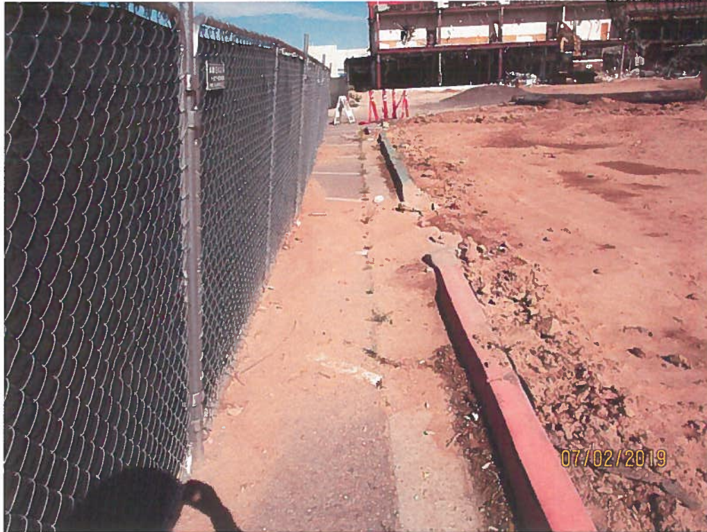
South edge of northeast area requires a sediment BMP.