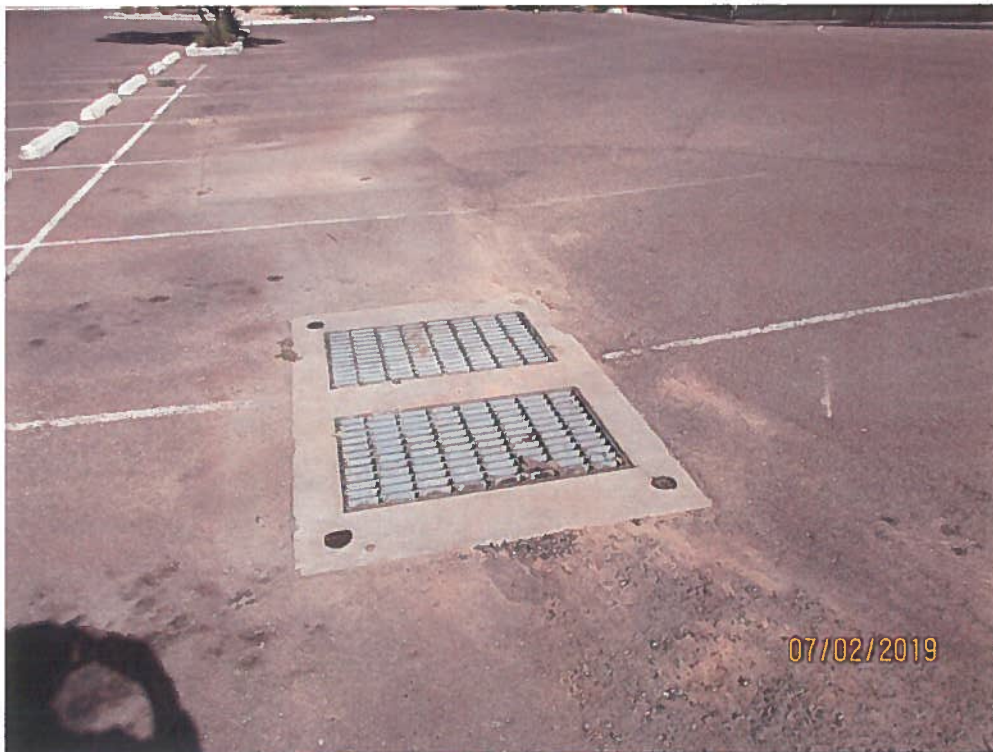
Inlet in parking lot with no protection that recieves drainage from the northeast area of the site where the black sludge and other demoition wastes are located.