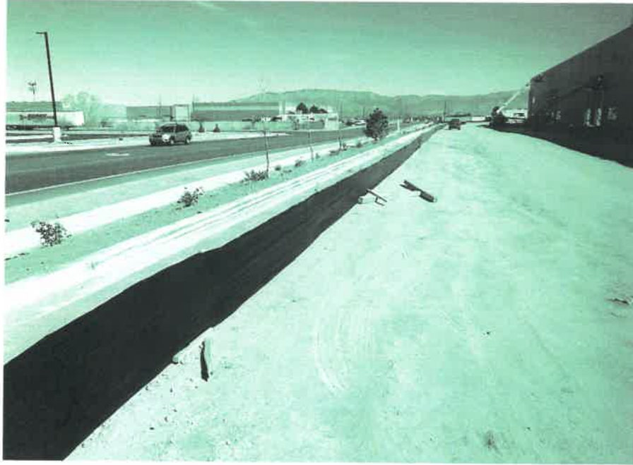
Landscaping/Silt Fencing in Progress