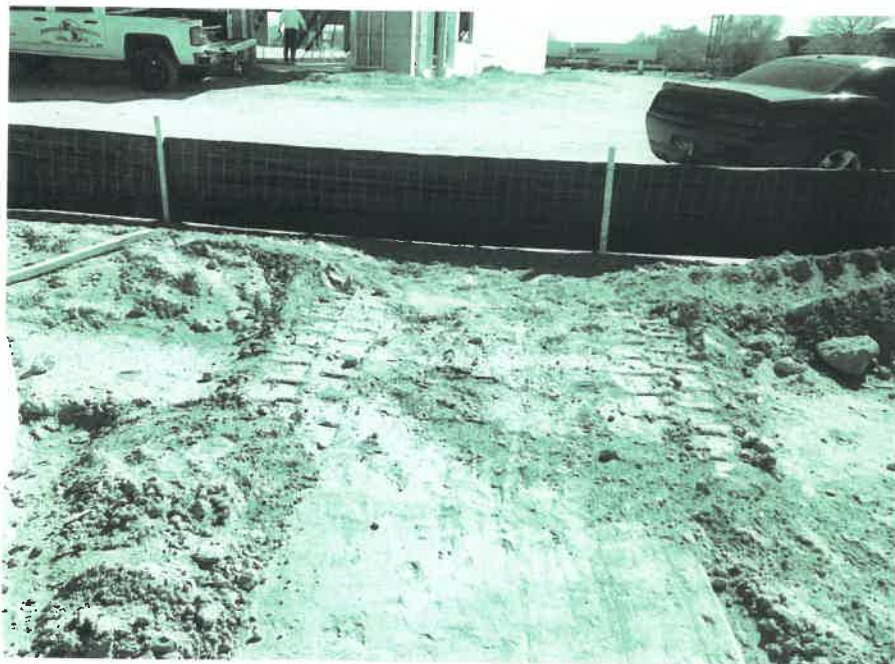
Key silt fencing into subgrade