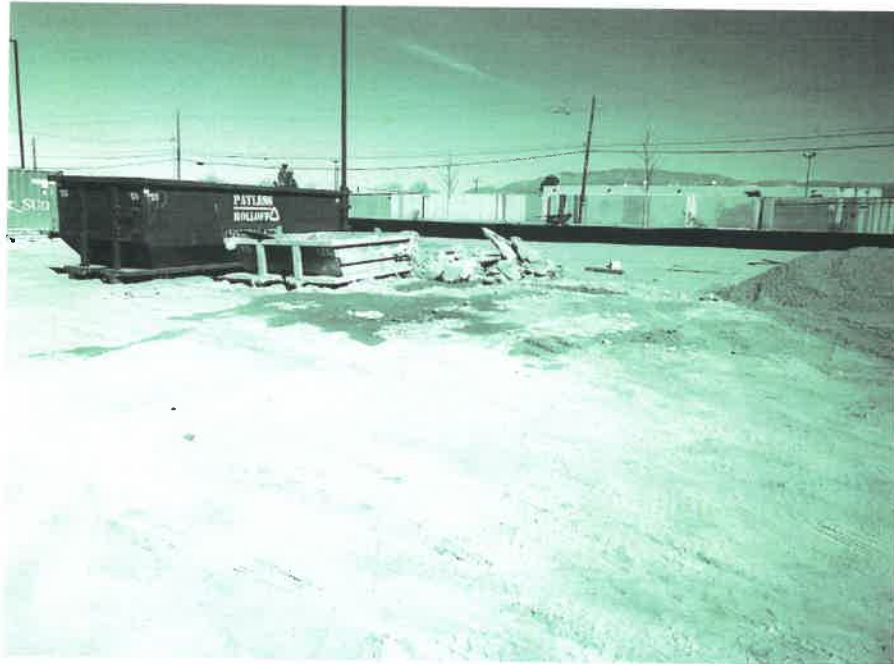
Concrete Wash requires maintenance and signage