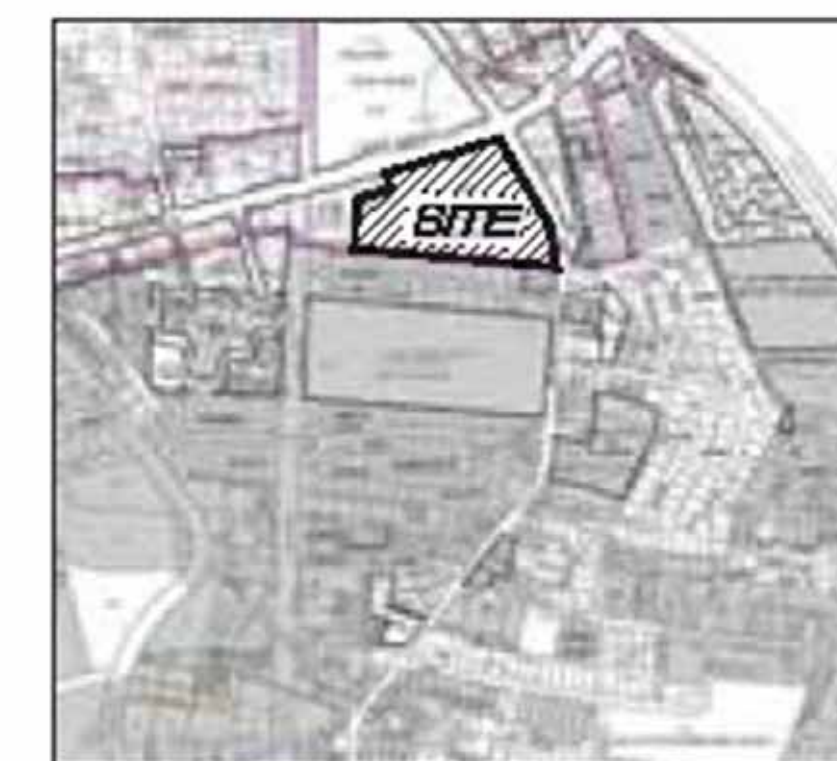
VICINITY MAP - Zone Atlas K-12

Remove structure and stabilize with crushed asphalt