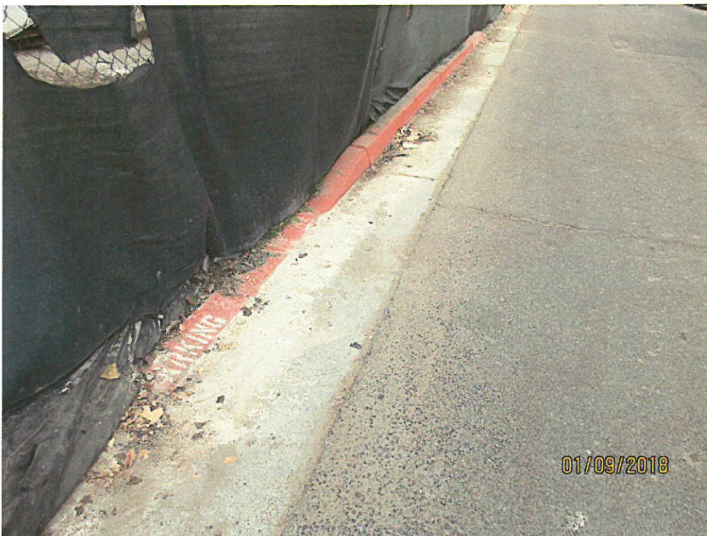
Remnants of wash-out in gutter of Silver Ave.