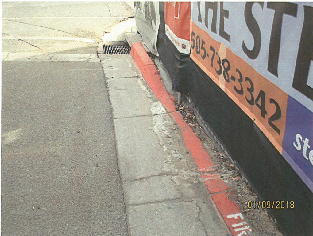
Remnants of washout that entered City's drainage system.