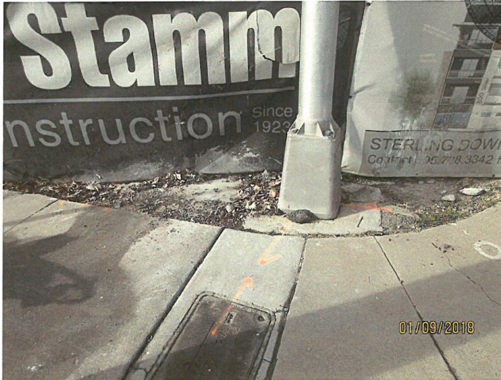
Wash-out draining over sidewalk.