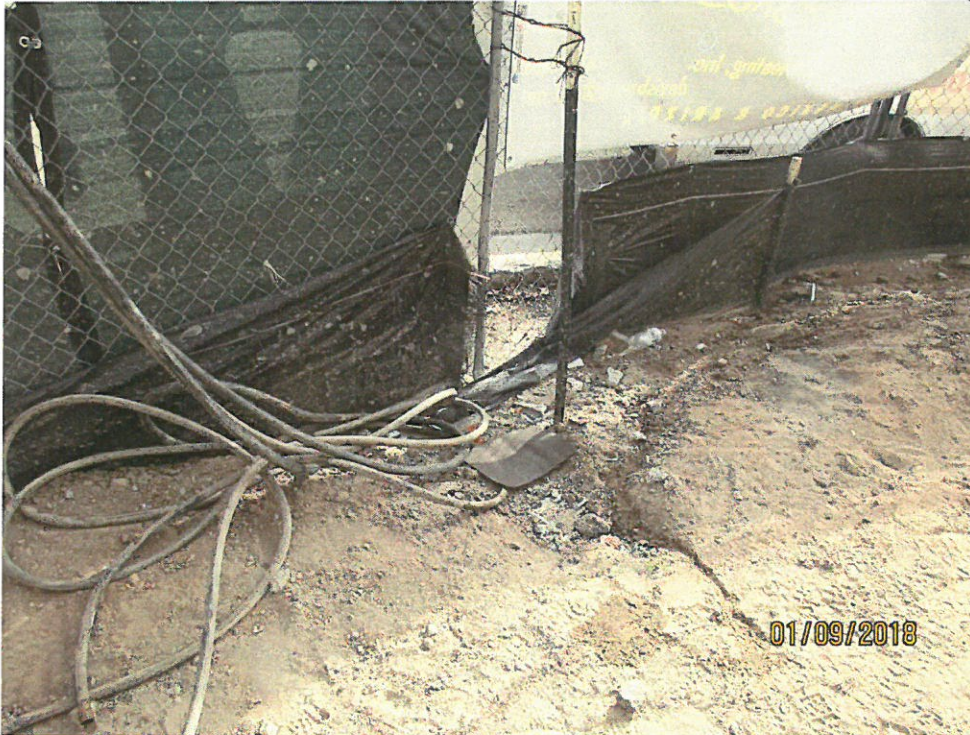
Silt fence requires maintenance.