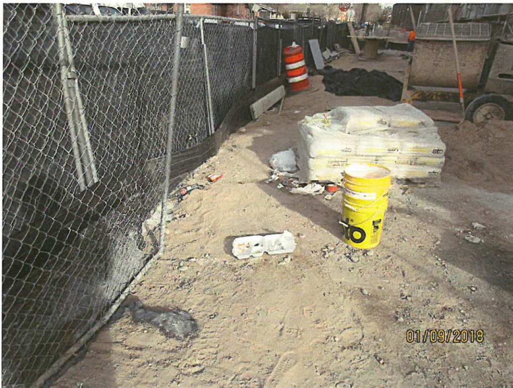
Trash on ground near west entrance.