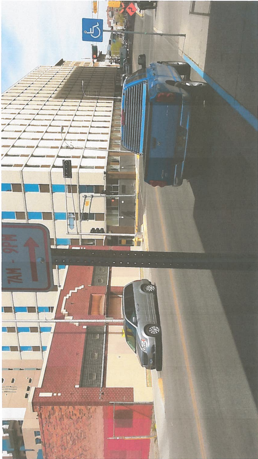
ADA Parking Spot