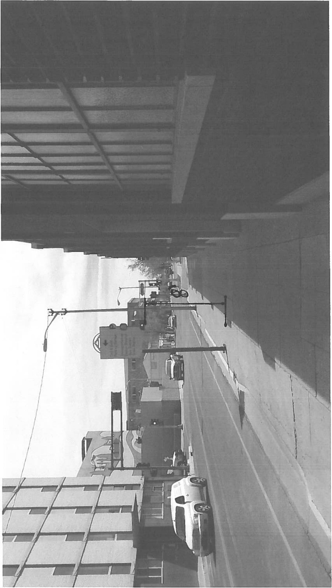
East side of building