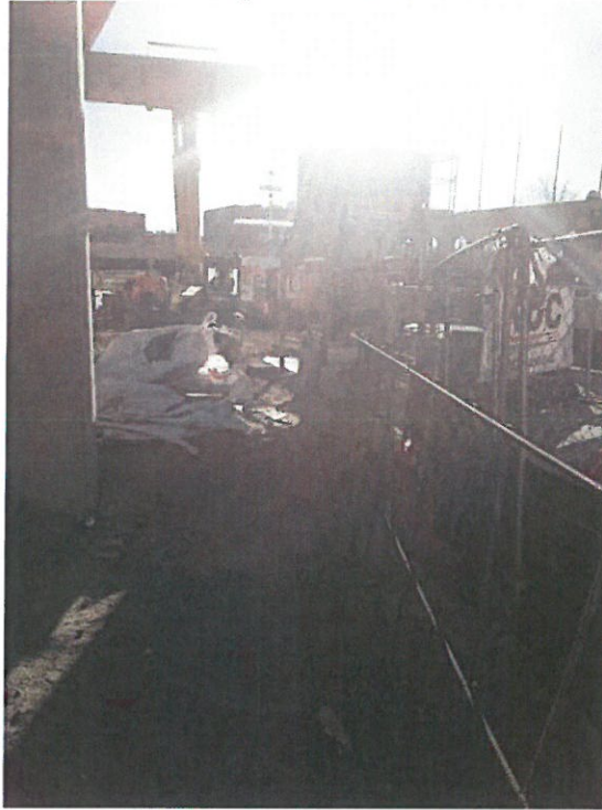
Temp Spec Mix