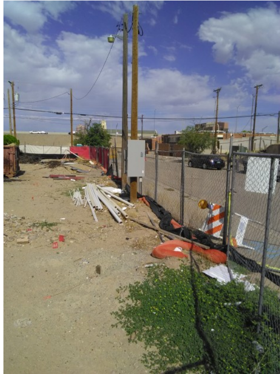
Site Walk Deficiency Photos - West Staging Area