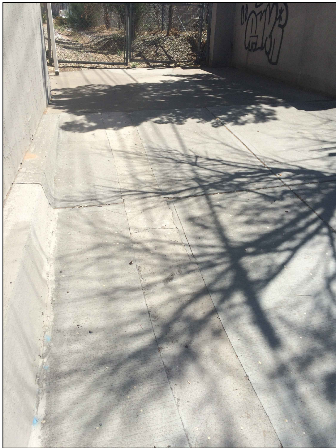
A3 PHOTO @ CURB CUT TO YALE