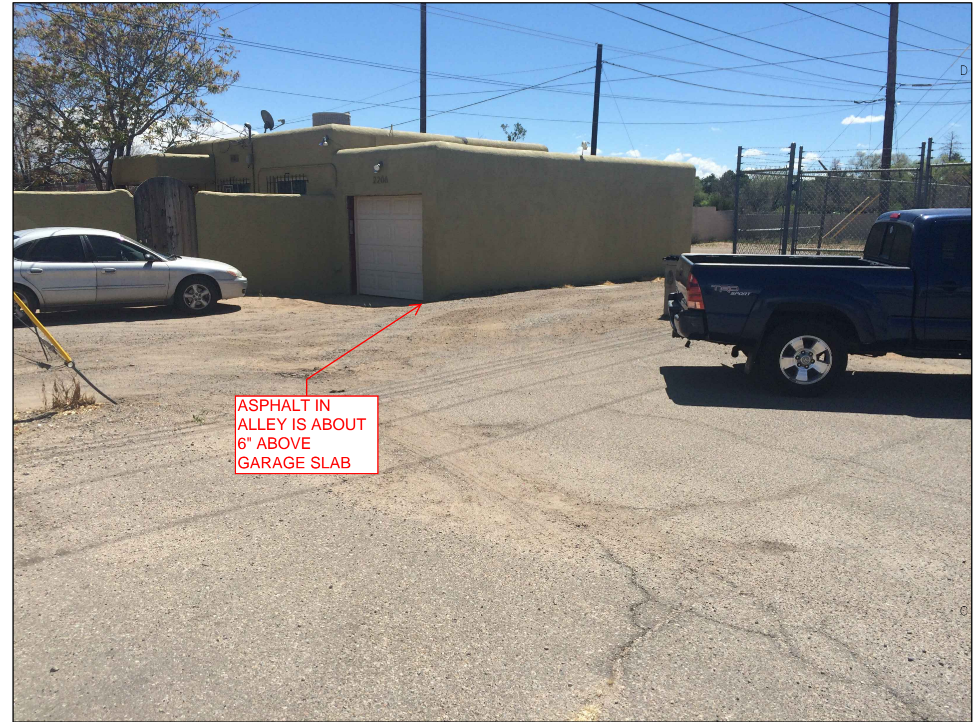
C4 PHOTO FROM PARKING LOT