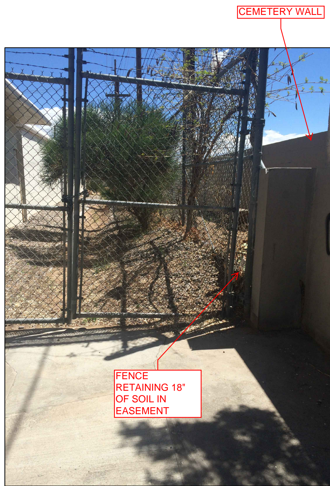
A4 PHOTO @ UTILITY EASEMENT