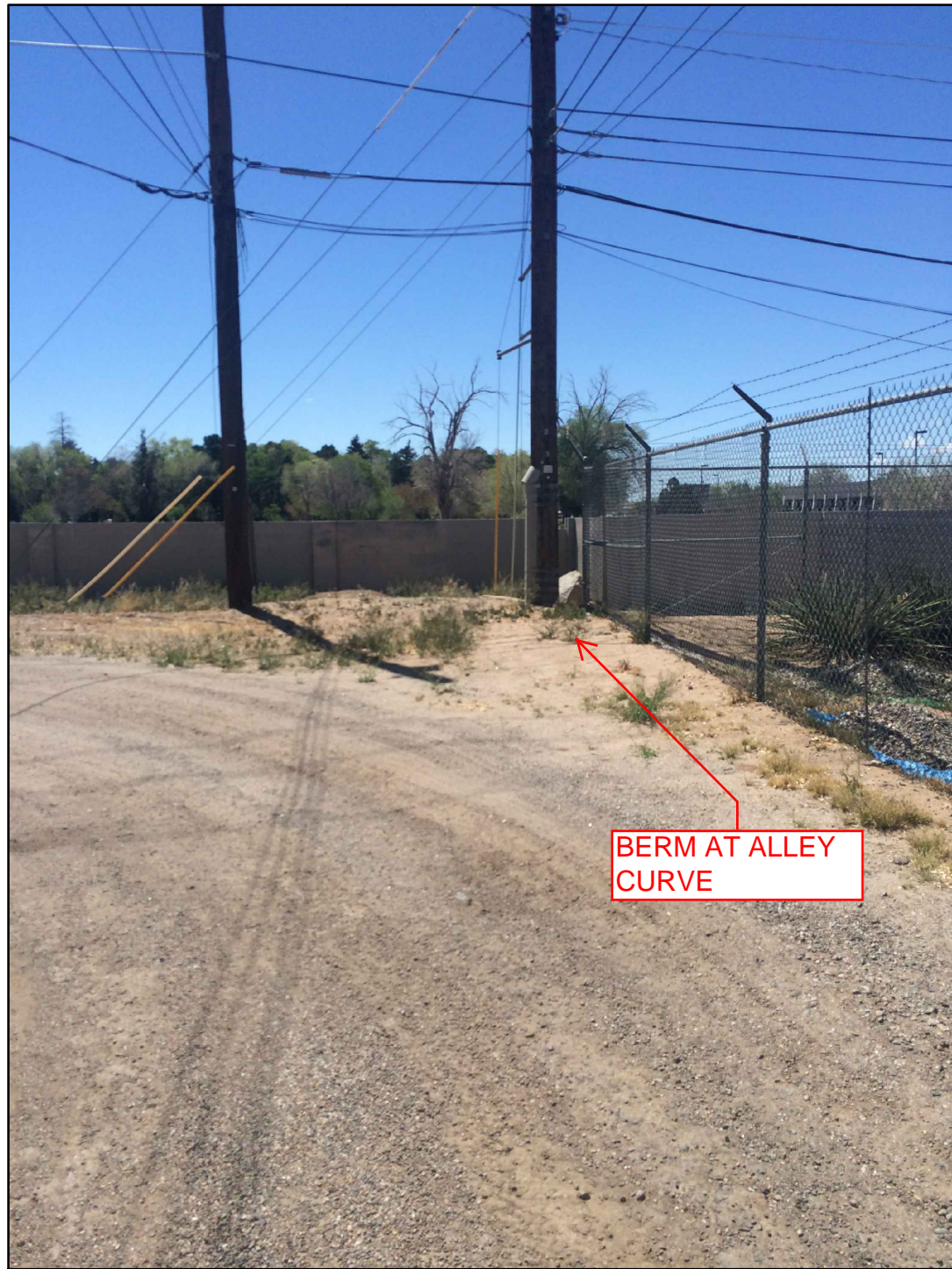
C1 PHOTO FROM ALLEY