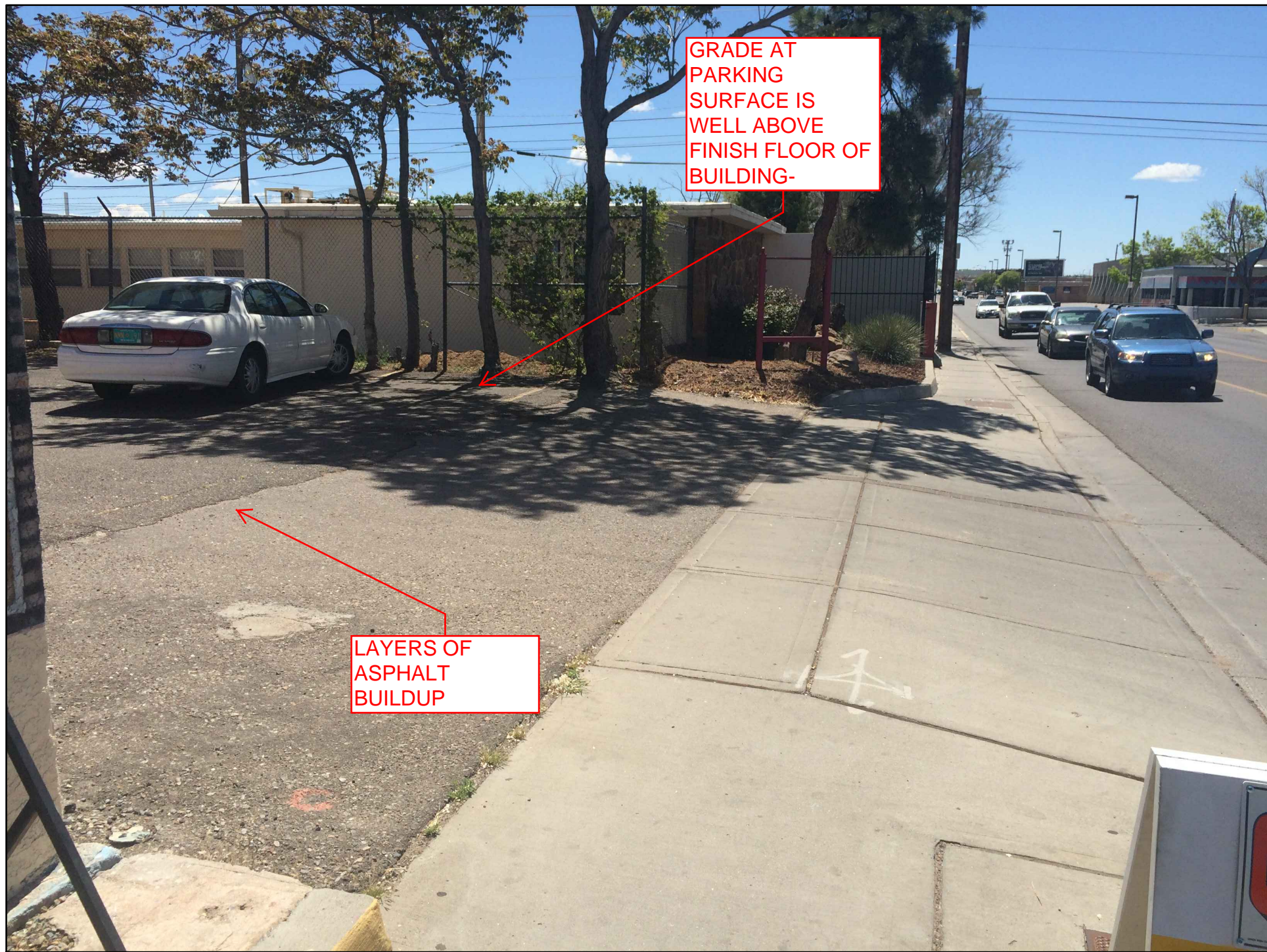
A1 PHOTO FROM PARKING LOT CURB CUT ON YALE