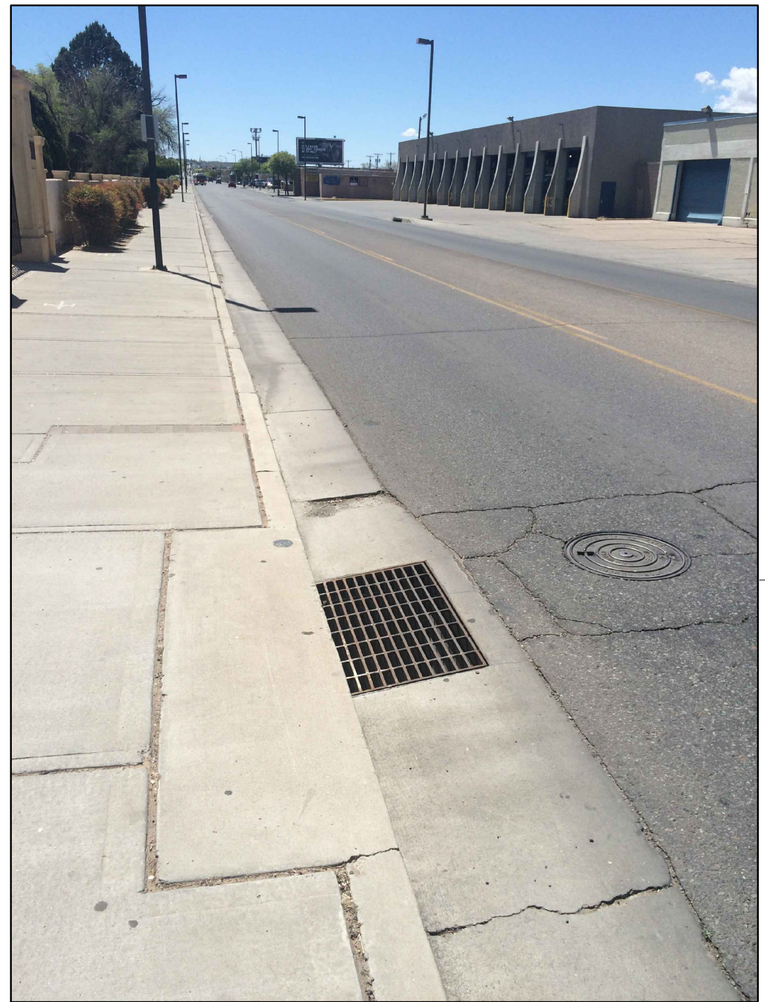
A5 PHOTO OF STORM DRAIN ON YALE

ALBUQUERQUE AQUAPONICS 512 YALE ST SE Albuquerque, NM 87108