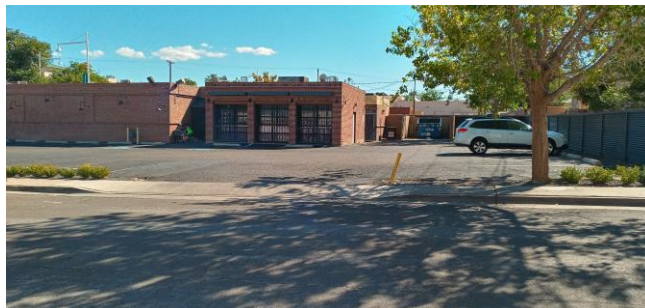
Existing Driveway on Maple Street.