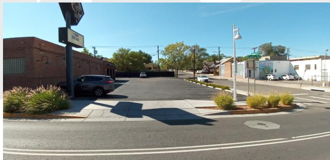
Existing Driveway on Central Avenue.