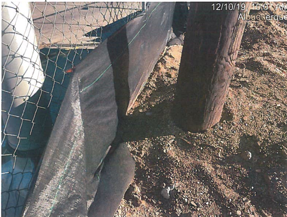
Dirt over top of mulch sock