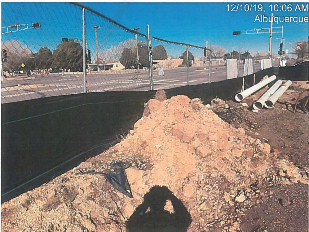
Dirt on silt fence