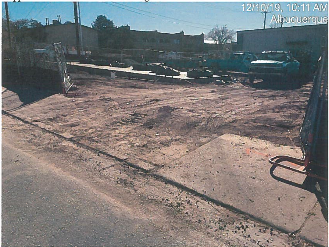
Copper Inlet protection