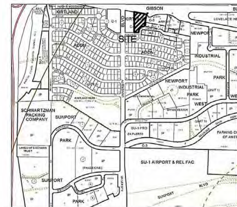
VICINITY MAP - Zone Map M-15-Z Legal Description: Lots 9-B-1A, Kirtland Addition Block A; Tract A, Airport Center

Note: When doing work in the City ROW (sidewalk, storm drain, drive pads) avoid dirt from getting into the street. If dirt is present in the street, the street should be swept every few days or the same day if rain is imminent. If stock piling dirt in the street and rain is forecasted, place wattles along the down slope side of the pile.