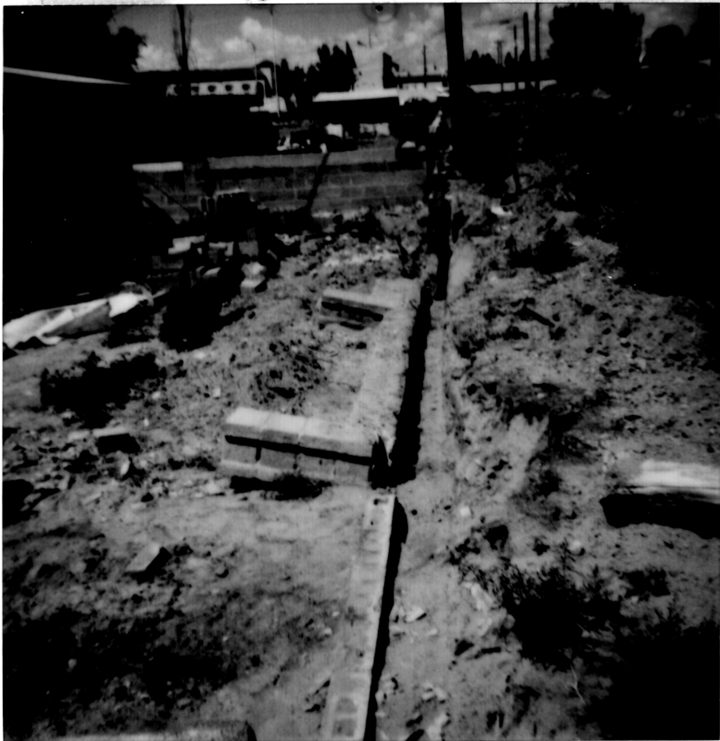
2508 Sycamore SE 8/22/94 looking from South to North on East P.L.