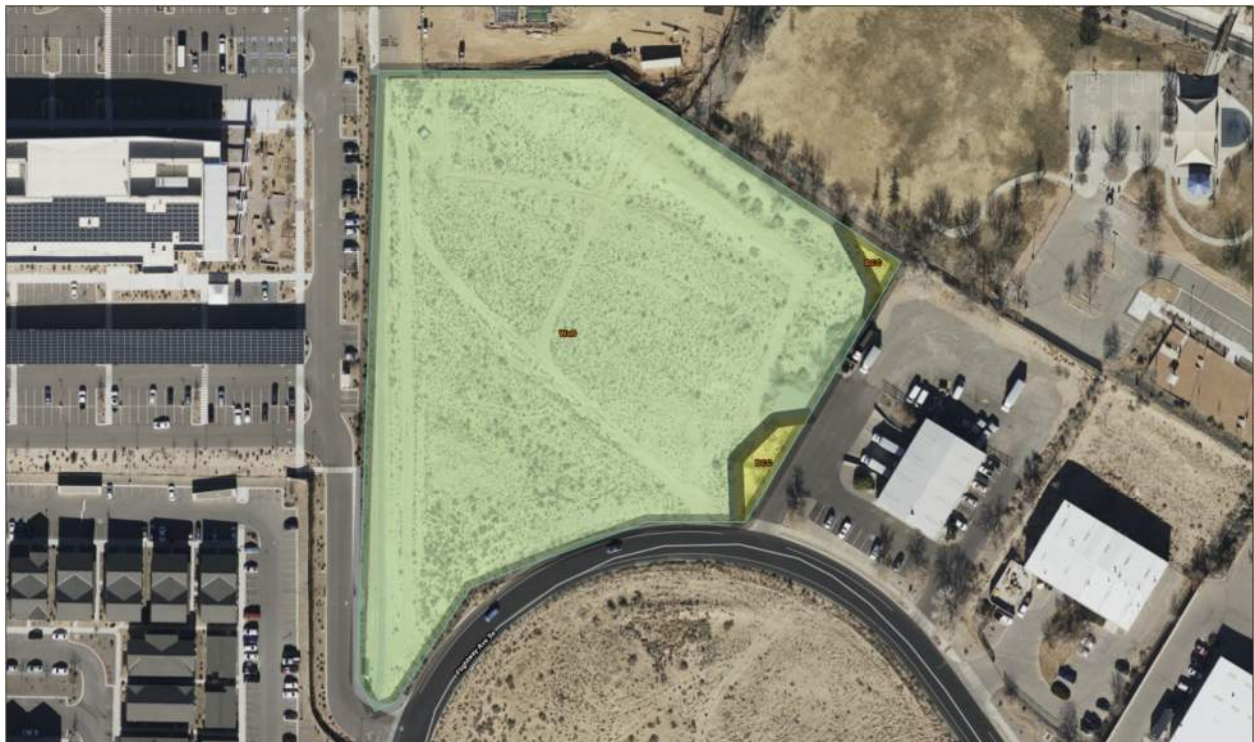
Figure 1.9 Area of Interest

Soil Type (NRCS Web Soil Survey): Area of interest is primarily considered to be Wink fine sandy loam, 0 to 5 percent slopes. Average K Factor of 0.28 per NRCS Web Soil Survey. See Figure 1.9 below.