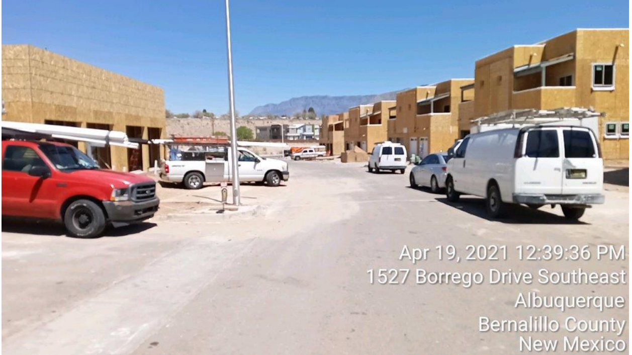
Apr 19, 2021 12:39:36 PM 1527 Borrego Drive Southeast Albuquerque Bernalillo County New Mexico