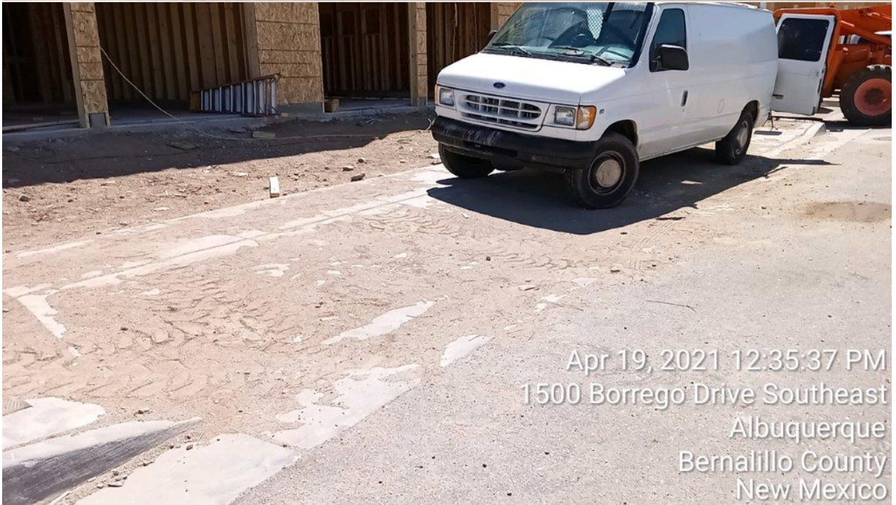
Apr 19, 2021 12:35:37 PM 1500 Borrego Drive Southeast Albuquerque Bernalillo County New Mexico