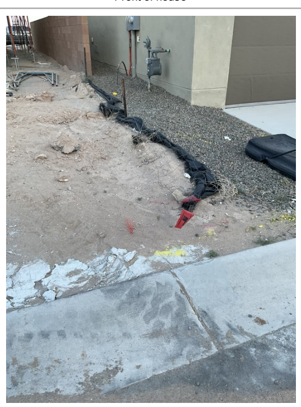
Back of house